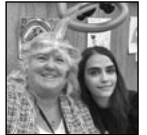
(above, right) Event included a balloon artist; cupcakes; ice cream, face painting, and bracelets.