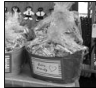
(left) Each family received a basket made possible by CASA of Passaic and Union Counties & the David Brearley Middle High School Bears That Care Program.