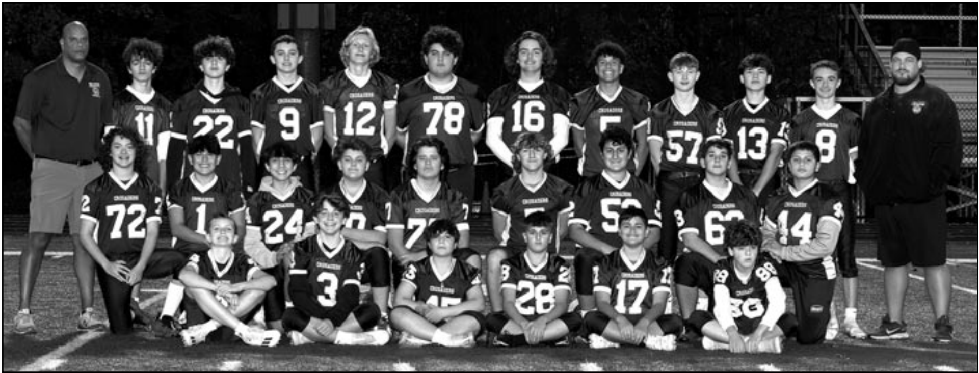
(above) CYF A Level