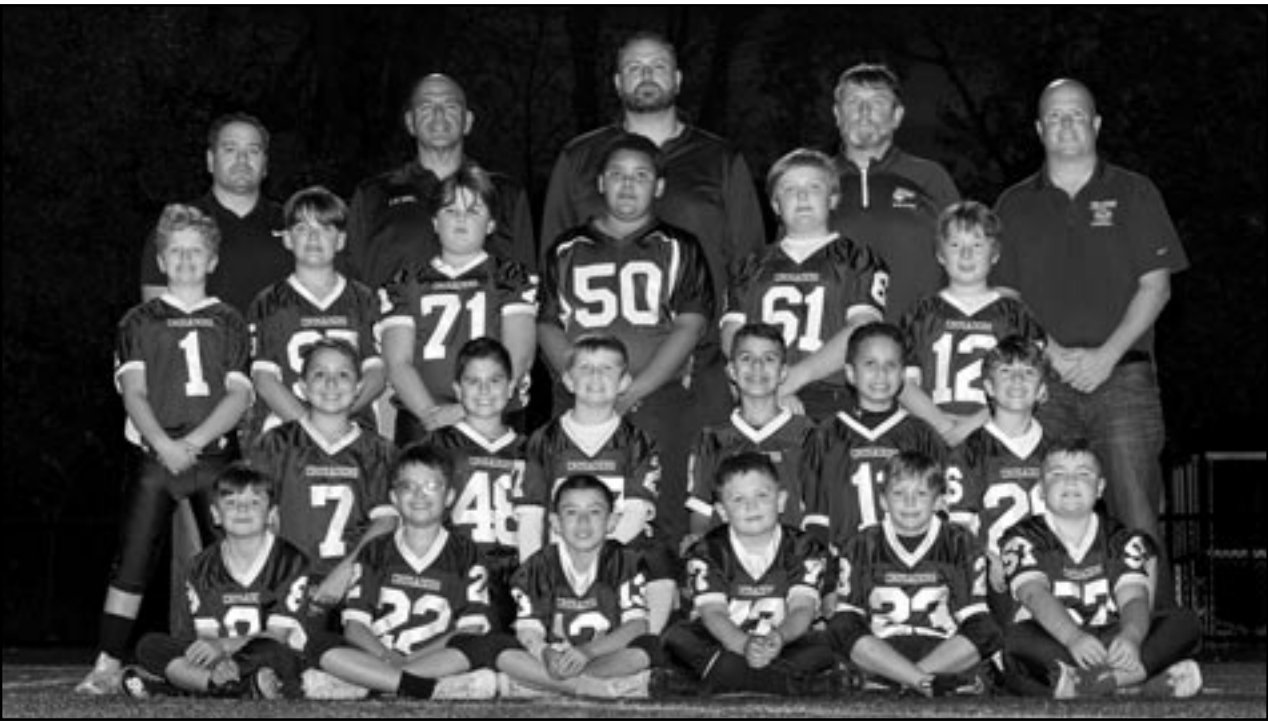
(above) CYF E Level

For more information, Friend the Gift and Thrift Boutique on Facebook, email giftandthriftboutique@gmail.com or call the church office at 908-925-1535.