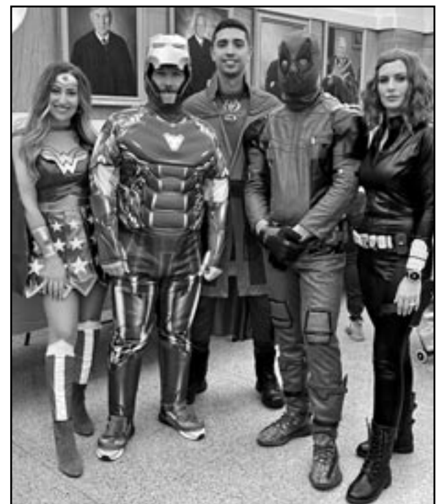
(above) Sheriff's officers dressed as superheroes, and maned a Batmobile outside the courthouse.