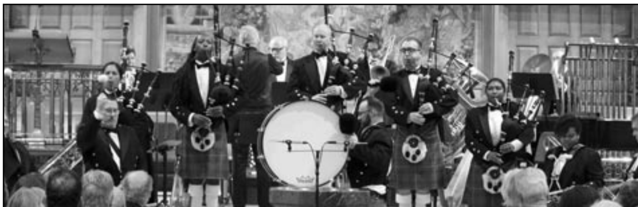
(above) Pipers from the Kevin Ray Blandford Memorial Pipe Band are returning to join the company of the 24th annual "Pipes of Christmas" concerts.