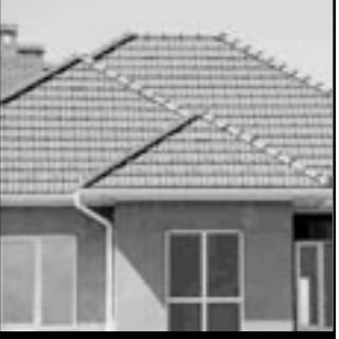
SPANISH STYLE ROOF