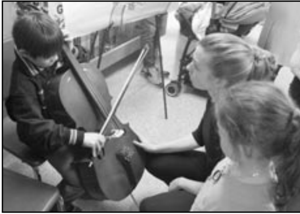
(above) Young audience members get to try out orchestra instruments at NJIO's Holiday Concert Instrument Petting Zoo. Instruments are loaned by Elefante Music.

NJIO is committed to ensuring that its programs and concerts are accessible. For more