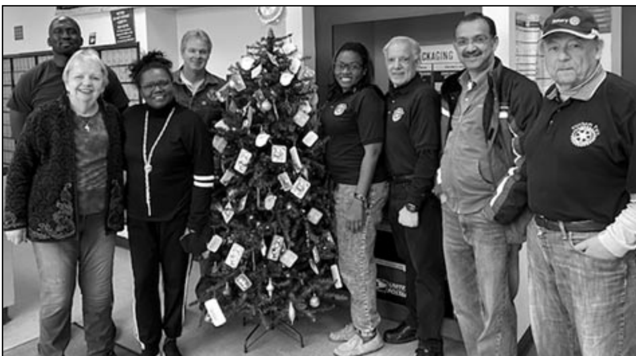
(above) The Angel Tree is located in the Florham Park Post Office at 187 Columbia Turnpike