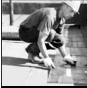
FLAT TOP ROOF