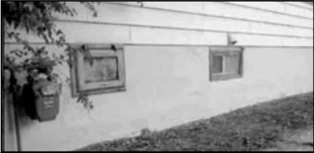
FOUNDATION REPAIRS BEFORE & AFTER