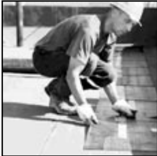
FLAT TOP ROOF