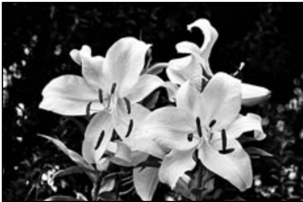
(above) Casablanca lilies make a stunning display in any garden. There are so many varieties of lilies to plant, it can be hard to choose.

When gardeners discuss autumn bulb planting, images of tulips and daffodils automatically spring into mind. These flowering bulbs create spectacular displays in our gardens, but save space for summer bulbs such as lilies. Although they won't bloom until next summer, planting them the autumn before gives them time to develop strong root system and stems. You will be rewarded with more robust blooms in the first year. From my experience I suggest planting small groupings. Most lilies are fragrant but too many together can easily become overwhelming.