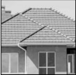
SPANISH STYLE ROOF