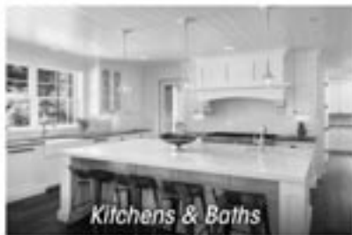
Kitchens & Baths