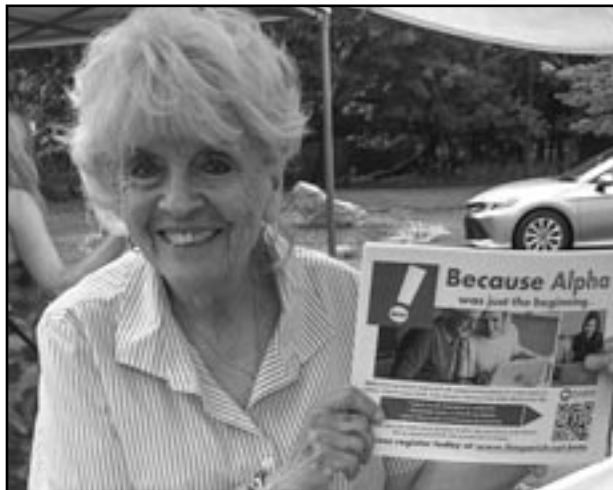
(above) Immaculate Heart of Mary Church in Scotch Plains to host a free spirituality seminar. Registration is required, please visit ihmparish.net/alpha . If you have any questions about Alpha, email: office@ihmparish.net or call: 908-889-2100.

The next Alpha Program will begin on Monday, September 18, 2023 with a dinner at 7 p.m. in the Nazareth Center at Immaculate Heart of Mary (IHM) Church, 1571 S. Martine Avenue, Scotch Plains. Since most meetings will be on Zoom it will require access to a device for the Zoom meetings. Links and directions for Zoom will be provided to those who register. Participation is capped at 30 people. Sign up by visiting the IHM website: ihmparish.net . If you have any questions about Alpha, email: office@ihmparish.net or call: 908-889-2100.