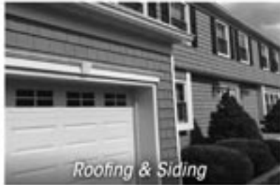
Roofing & Siding