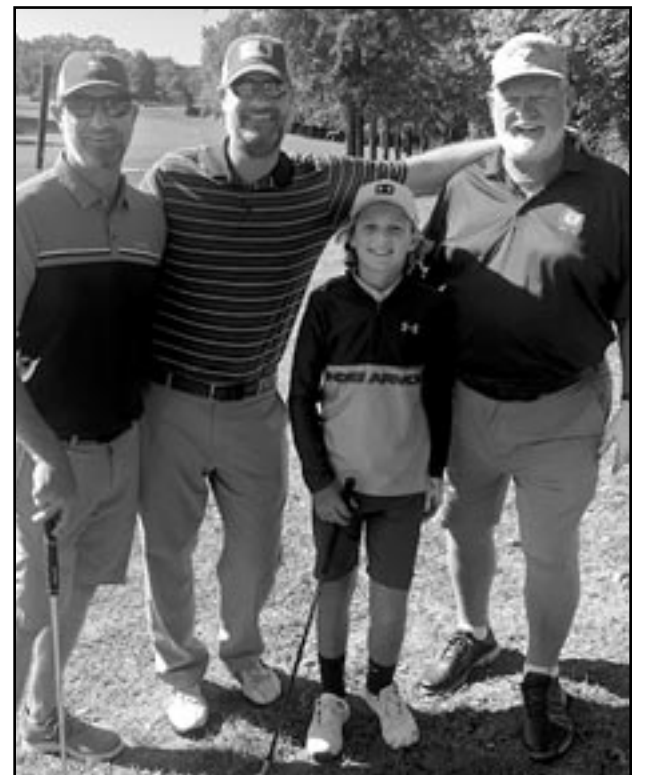
(above) Doran foursome at the 2022 Bernie Yarusavage Memorial Scholarship Golf Outing.

Sign up as an individual, or a group, or be a sponsor to contribute to the success of the outing. Breakfast prior and BBQ lunch follows.