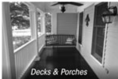
Decks & Porches