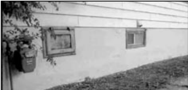
FOUNDATION REPAIRS BEFORE & AFTER