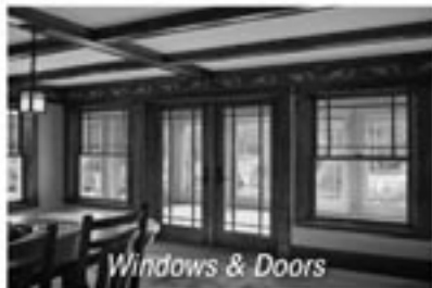
Windows & Doors