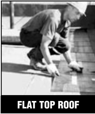
FLAT TOP ROOF