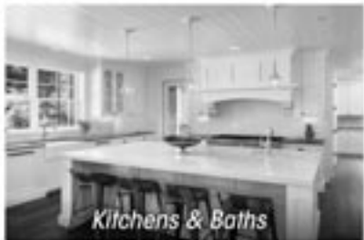
Kitchens & Baths