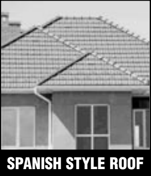
SPANISH STYLE ROOF