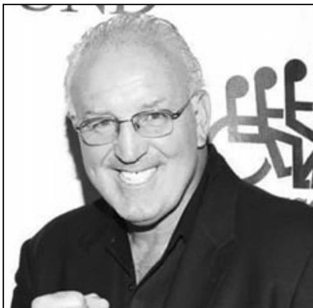
(above) Gerry Cooney,