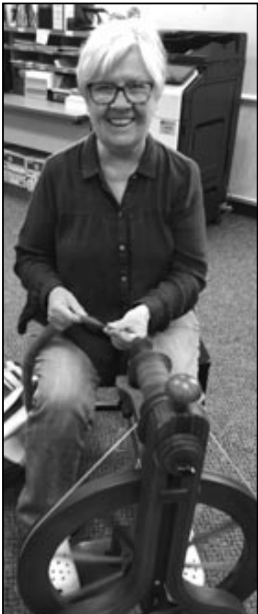
(above) Dee from Union