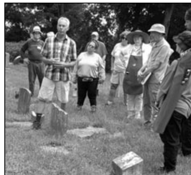
(above) DAR members attended a summer workshop on how to preserve historic cemeteries at the Presbyterian Church in Morristown, N.J.

Snyder-Continental Chapter is based in Green Brook and serves areas in Somerset, Middlesex and Union counties. Contact ESCchapterDAR@gmail.com or learn more at DAR.org .