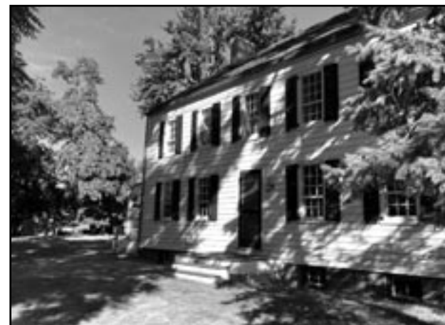
(above) The Dr. John. Vermeule House, located at 223 Rock Avenue, Green Brook, will be open for visitors on Saturday, September 19th from 10:00 a.m. - 12:00 p.m.

The Green Brook Historical Society meetings are held at Green Brook Town Hall, 111 Greenbrook Road, on the 3rd Thursday of every month at 7:30 p.m. We also offer Zoom, for those who can't come in person. Our group has a lot of fun exploring our local history and doing our best to preserve and document its rich heritage. Please consider joining us! For additional information, please contact 732-968-7696. Please leave a brief message with your name and phone number where you can be reached at and you'll receive a call back.