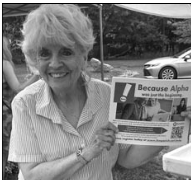
(above) Immaculate Heart of Mary Church in Scotch Plains to host a free spirituality seminar.

The next Alpha Program will begin on Monday, September 18, 2023 with a dinner at 7 p.m. in the Nazareth Center at Immaculate Heart of Mary (IHM) Church, 1571 S. Martine Avenue, Scotch Plains. Since most meetings will be on Zoom it will require access to a device for the Zoom meetings. Links and directions for Zoom will be provided to those who register. Participation is capped at 30 people. Sign up by visiting the IHM website: ihmparish.net . If you have any questions about Alpha, email: office@ihmparish.net or call: 908-889-2100.