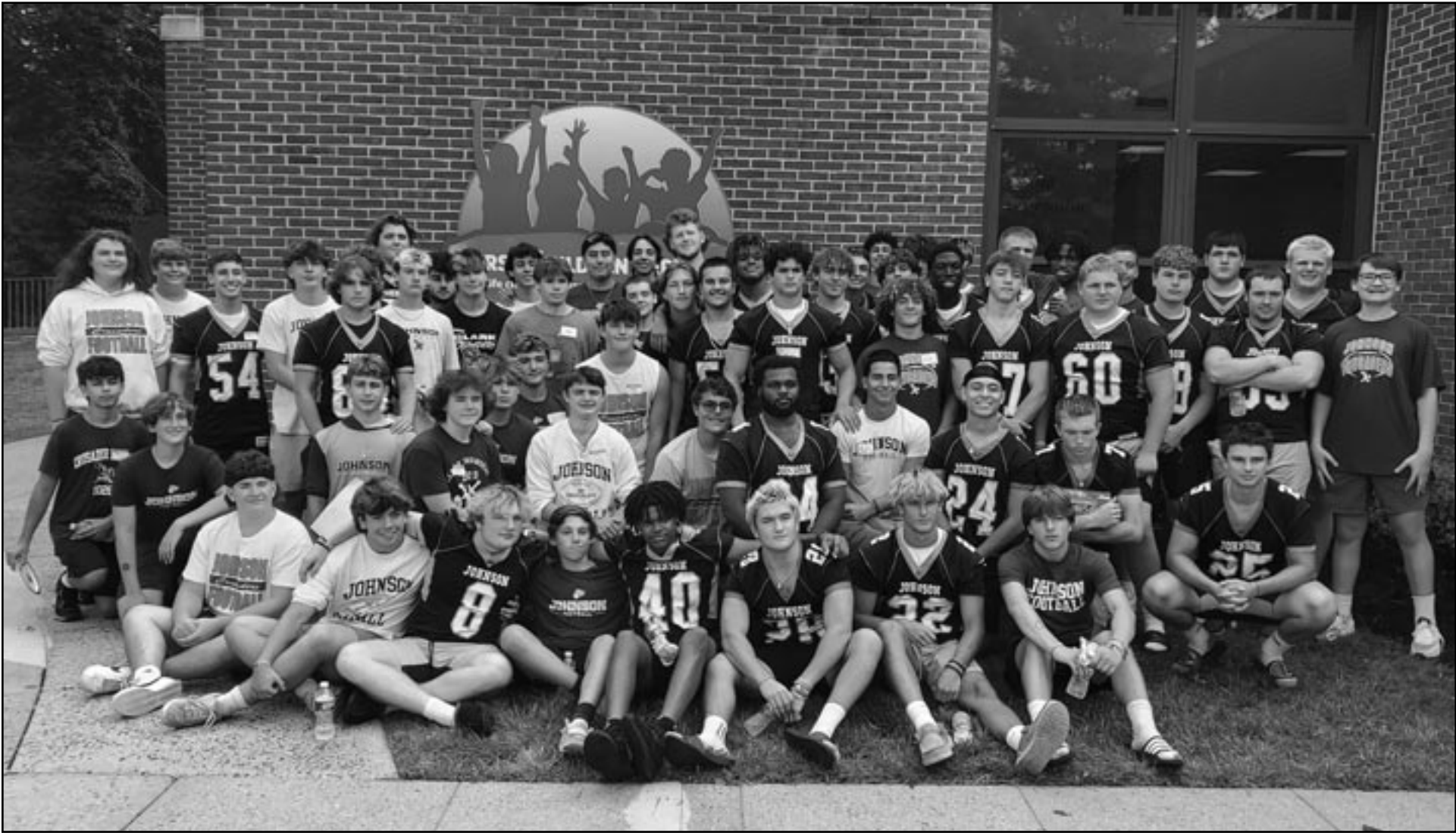
(above) The 2023 Arthur L. Johnson Crusader Football Team visits the First Children’s School on Friday, August 11, 2023.