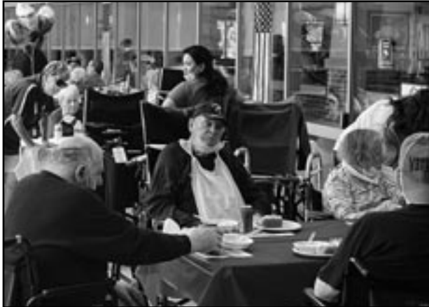
(above) More than 20 Elks from the East Central District sponsored a picnic at the Menlo Park Veterans Memorial Home in Edison.

providing them with services where they live. For more information about the Elks and how to join, please visit elks.org .