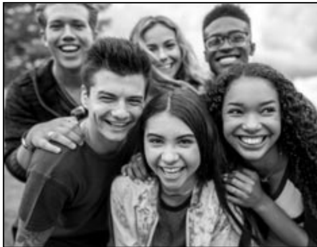
(above) Registration Begins August 15th for The Gateway Family YMCA's 7th Grade Initiative.

The 7th Grade Leader's Club, a structured program offering teens leadership and volunteer