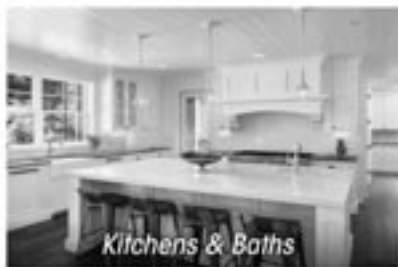
Kitchens & Baths