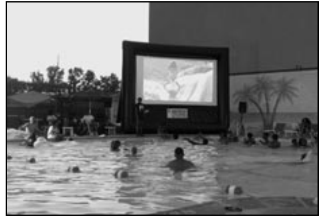
(above) Attendees both young and old at last year's screening of "Luca"

The movies are scheduled to begin at sunset. The Columbian Swim Club's $5 daily admission fee covers the movie. For more information and updates on Recreation events, visit uniontownship.com/147/Recreation , or follow on Instagram @twpunionnjrec.