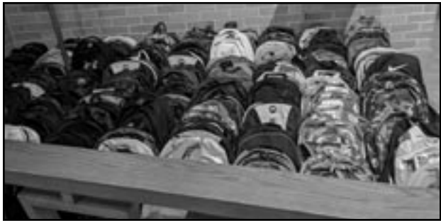
(above) Our goal is to reach 250 backpacks. Items can be dropped off at Faith Lutheran, 524 South Street, New Providence, 07974, in the marked green bin found underneath the sheltered alcove by the main doors at the bottom of the parking lot. You can mail a financial gift made payable to Faith Lutheran Church with “backpacks” in the memo line of your check and we will shop for you.