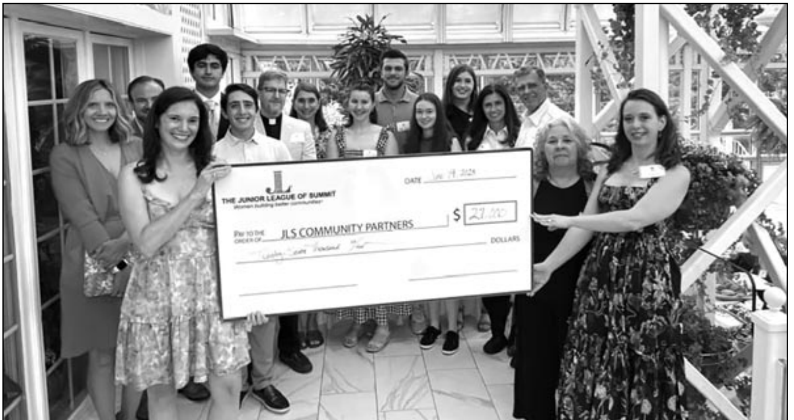
(above) $27,000 was awarded in grants to the JLS Community Partners.

*****ECRWSSDDM***** POSTAL PATRON NEW PROVIDENCE, NJ 07974