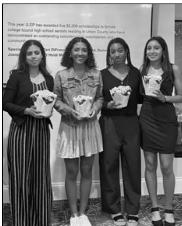
(above) The Junior League of Elizabeth-Plainfield awarded five $5,000 scholarships.