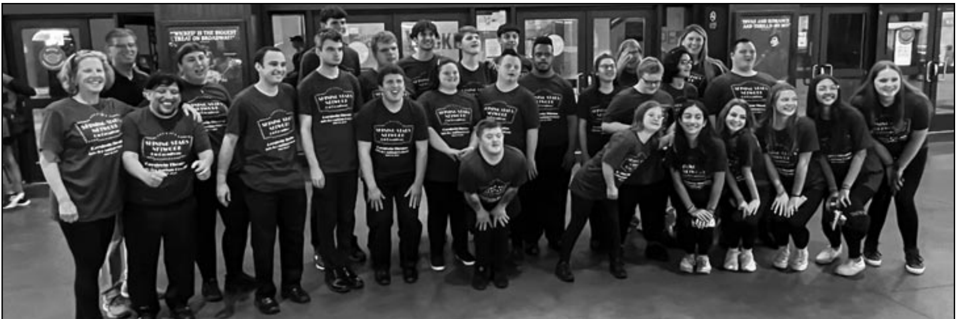
(above) Performers with Special Needs take the main stage on August 5th at the Paper Mill Playhouse. Tickets start at $25 and can be purchased at: my.papermill.org/shiningstars . The Shining Stars Network has performed in front of large audiences, and most recently the Gershwin theater on Broadway in New York City.