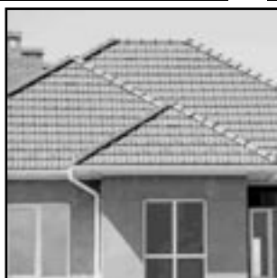
SPANISH STYLE ROOF