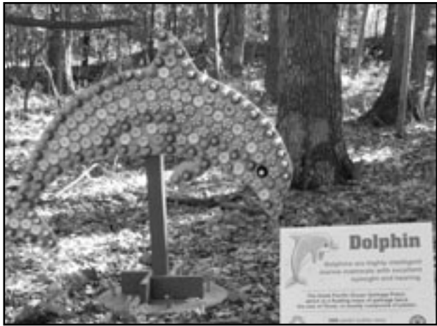
(above) Recycled Dolphin Artwork created by Trailside Nature & Science Center as part of plastic pollution education outreach.

Learn more at njclean.org and litterfreenj.org .