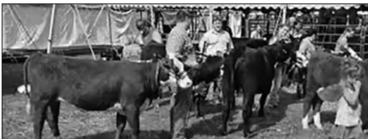
(above) Animals shows from pets to livestock are popular events.