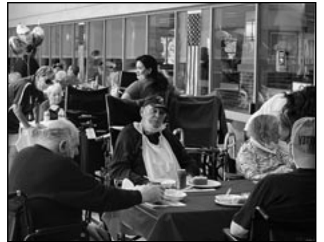
(above) More than 20 Elks from the East Central District sponsored a picnic at the Menlo Park Veterans Memorial Home in Edison.