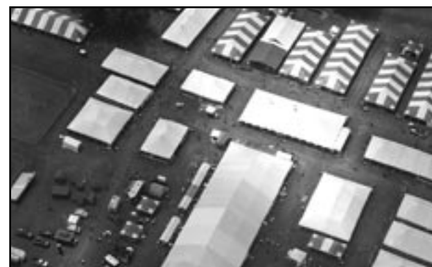
(above) The 4-H Fair offers 15 acres of Free Family Fun.

The Somerset County 4-H Fair is August 9-11, 10 a.m. to 10 p.m., at North Branch Park on Milltown Road in Bridgewater. Admission and parking are free. Visit 4HisTops.org .