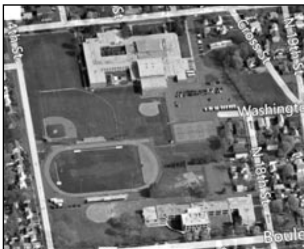
(above) Brearley campus, former Jackson Pond area, 2015.