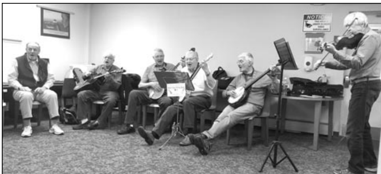
(above) Good Tyme String Band