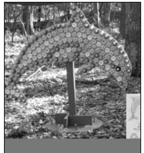
(above) Recycled Dolphin Artwork created by Trailside Nature & Science Center as part of plastic pollution education outreach.