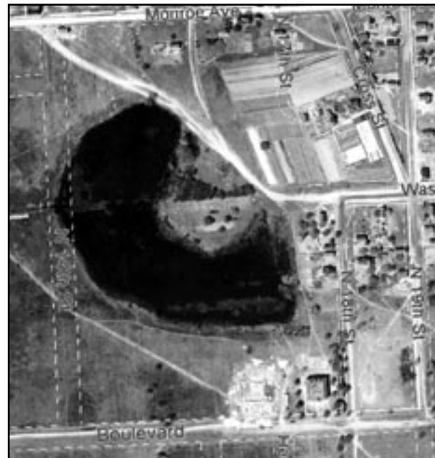
(above) Dark area is Jackson Pond, 1923.