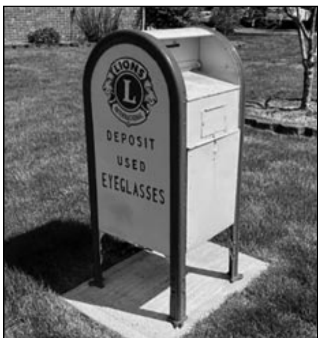
(above) The New Providence Lions Club Eyeglass collection site is in front of the New Providence Library which is located at 377 Elkwood Ave. When collected, these glasses are sorted and sterilized and are then donated to a charity and/or medical organizations that provides free eye exams and eyeglasses to needy people in the countries they serve.