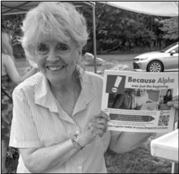
(above) Immaculate Heart of Mary Church in Scotch Plains to host a free spirituality seminar. Registration is required, please visit ihmparish.net/alpha .