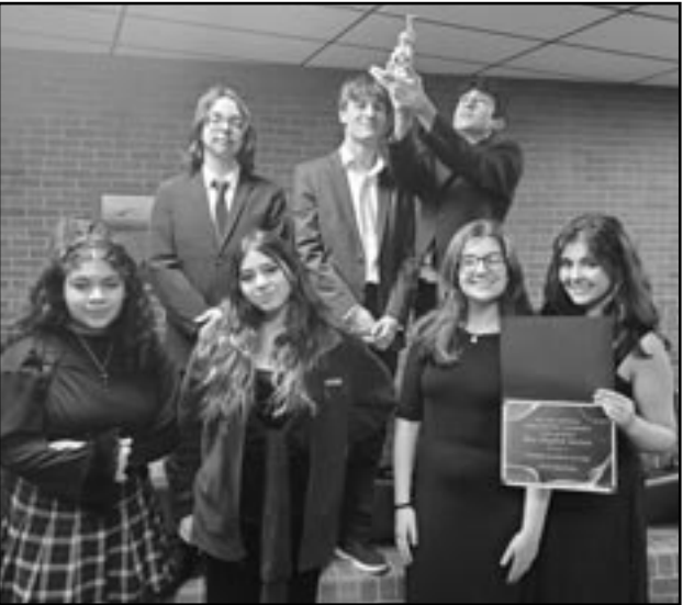
(above) The group's Rhythm Section won best rhythm at Manchester High School during the Tournament Indoor Association Jazz Competition, beating 7 other schools. The Jazz Band has also just placed 3rd in their Region Championships getting their highest score to date.