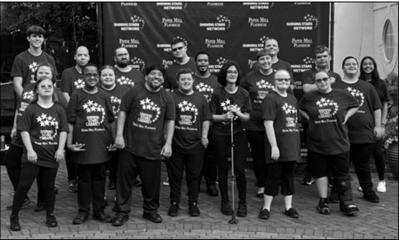
(above) Performers with Special Needs take the main stage on August 5th at the Paper Mill Playhouse. Tickets start at $25 and can be purchased at: my.papermill.org/shiningstars . The Shining Stars Network has performed in front of large audiences, and most recently the Gershwin theater on Broadway in New York City.