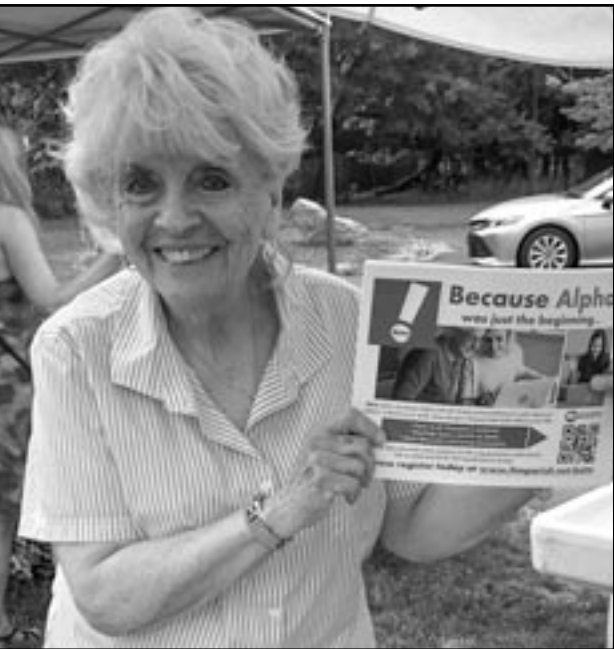
(above) Immaculate Heart of Mary Church in Scotch Plains to host a free spirituality seminar. Registration is required, please visit ihmparish.net/alpha .