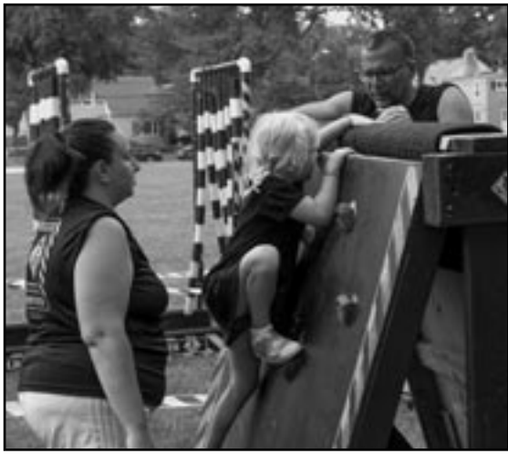
(above) Obstacle course