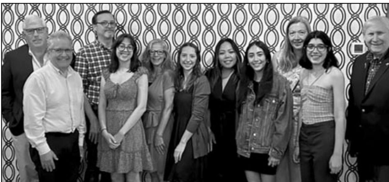
(above) F-SP Rotary Foundation Scholarship recipients attended a dinner in their honor.