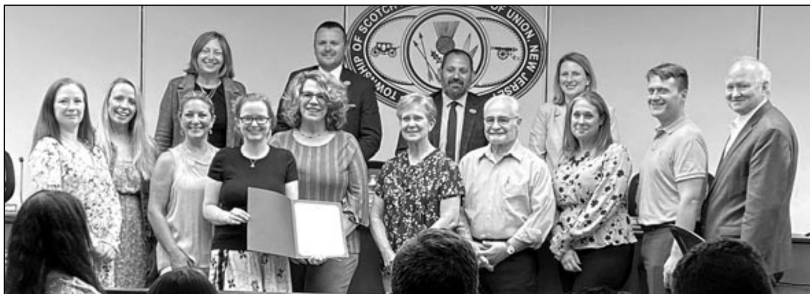
(above) The Scotch Plains-Fanwood Scholarship Foundation was honored at the Scotch Plains Township Council.

Since 1966, The Scotch Plains-Fanwood Scholarship Foundation has been awarding scholarship assistance to graduating seniors and current college students residing in Scotch Plains and Fanwood. To date, the Foundation has awarded over $4 million to deserving local students. Scholarships are made possible by the Foundation's efforts during its annual Dollars for Students campaign. In addition to the Dollars for Students awards, the Foundation administers over 50 separate honorary and memorial scholarships, funded via individuals or groups from the local community and beyond. Scholarship assistance is made possible by Scotch Plains and Fanwood businesses, organizations, community members, and other contributions. For more information visit spfscholarshipfoundation.org .