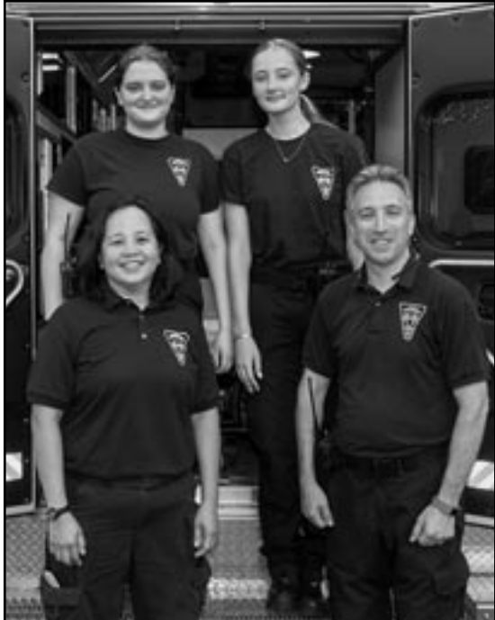
(above) Fanwood Rescue Squad