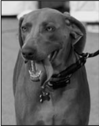
(above) Friendly Weimaraner