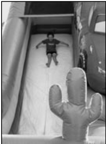
(above) Giant slide