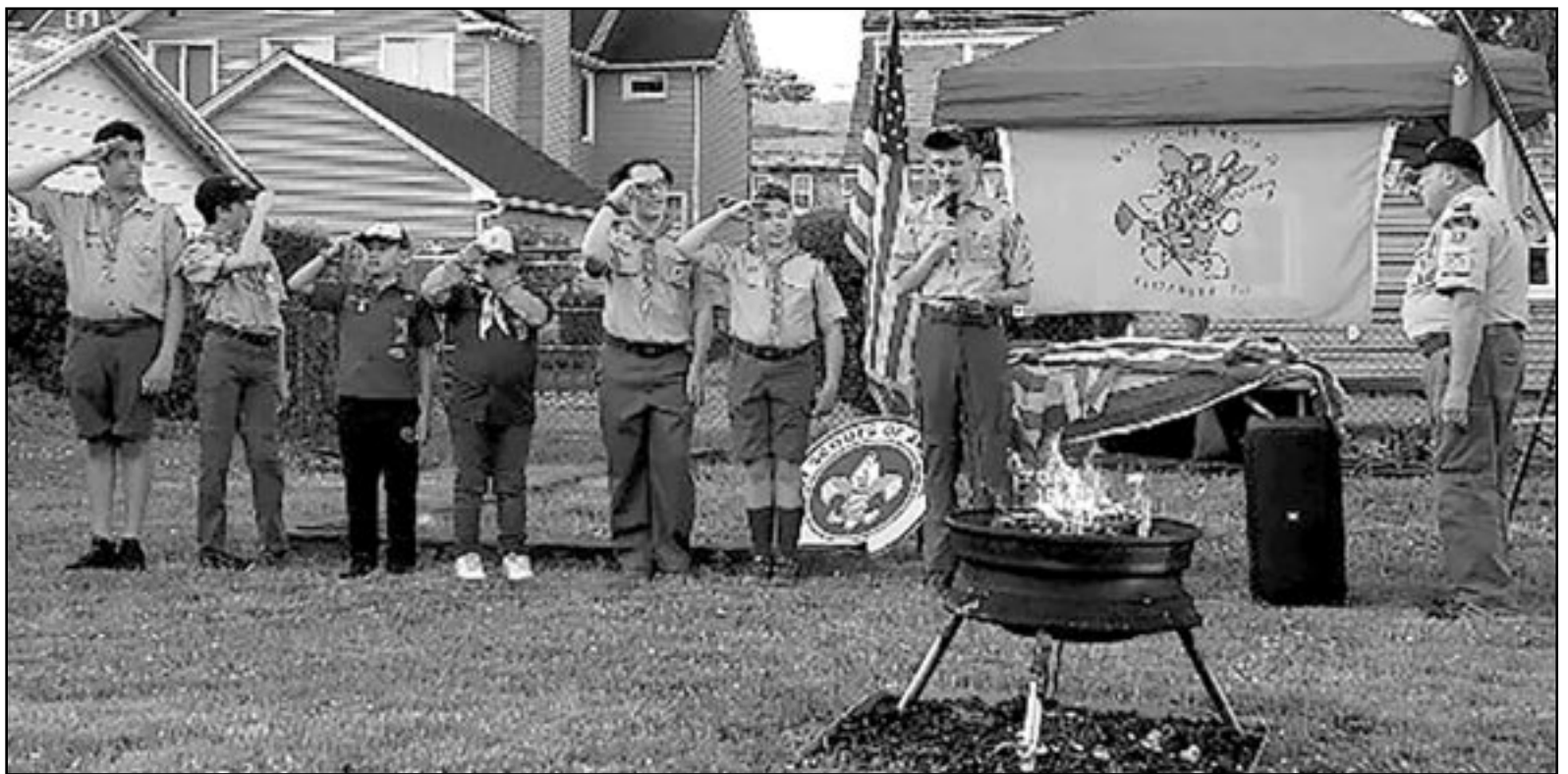
(above) Scouts and leaders of Cub Scout Pack 23 and Boy Scout Troop 23 salute the American flag at the beginning of their annual flag retirement ceremony on Flag Day.