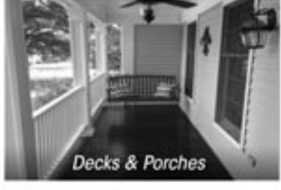
Decks & Porches