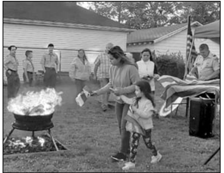
(above) Scouts, leaders and family members take turns retiring old American flags by burning them in a ceremony on Flag Day. Boy Scout Troop 23 and Cub Scout Pack 23 conduct the ceremony annually at St. Genevieve's Church in Elizabeth.

The Scouting program instills character, good citizenship and physical fitness in youth through outdoor activities such as campouts and hikes, involvement in community activities, and just plain fun! Cub Scout Pack 23 and Boy Scout Troop 23 provide activities and training for children of all faiths, from Kindergarten through high school graduation. For more details, please contact Dan Bernier, Scoutmaster, at (908) 451-1948 or webfootroop@gmail.com.