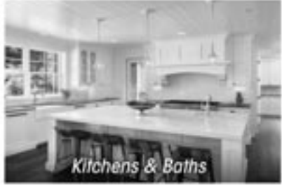
Kitchens & Baths