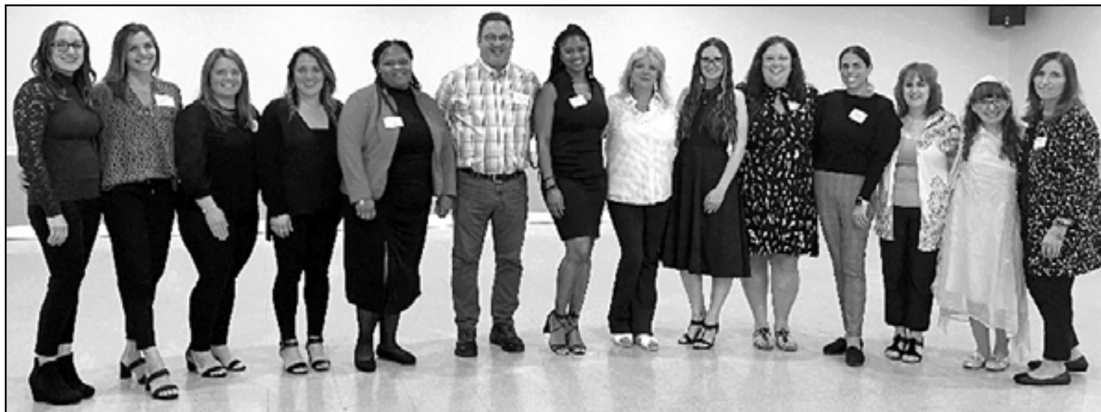
(above) The Township of Union Education grant recipients for the 2023-2024 school year.