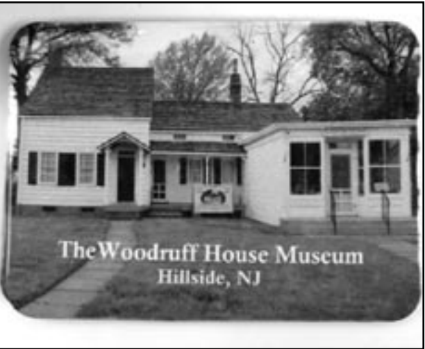
(above) A banner in front the Woodruff House, Eaton Store Museum, and Phil Rizzuto All Sports Museum, 111 Conant Avenue, Hillside, notes the 50th anniversary of the Hillside Historical Society from its founding in 1973.