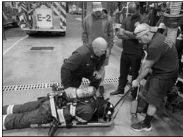
(above) Members of the New Providence Volunteer Fire Department demonstrate how the FAST Rescue Boards can be used to rescue a downed firefighter.