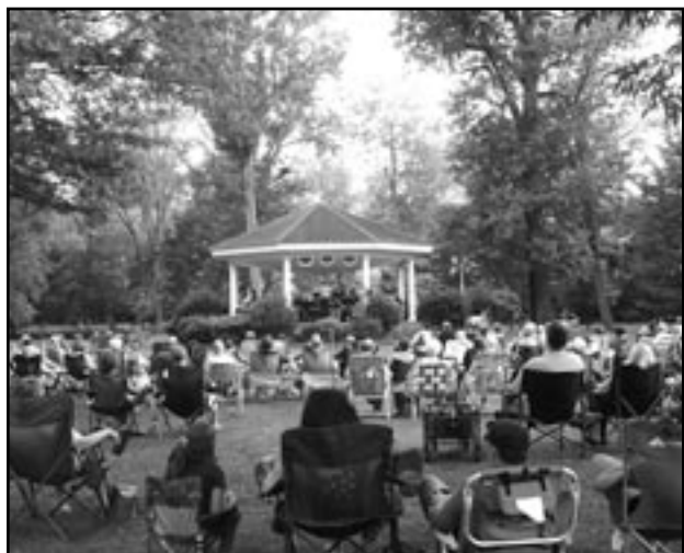
(above) The Westfield Community Concert Band continues its annual Summer Concert Series in Mindowaskin Park, Westfield, with performances on June 29, July 6, and 13 at 7:30 p.m.