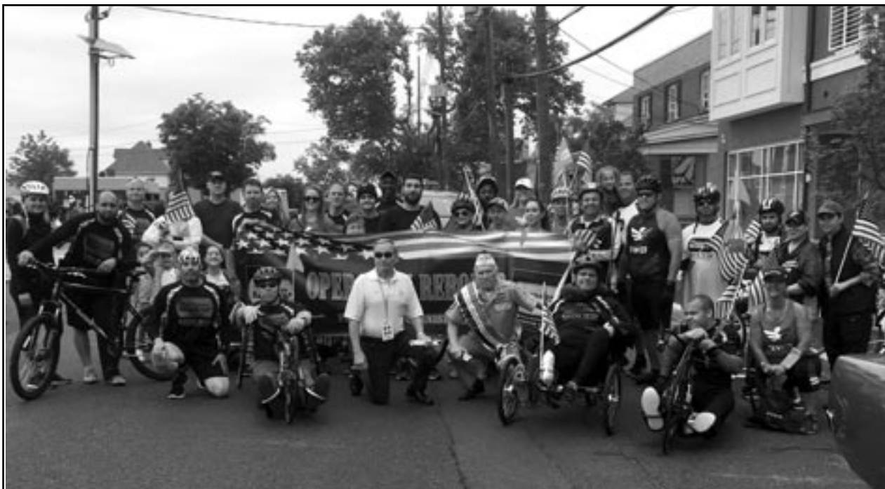
(above) New Jersey Veterans Network veterans and volunteers at a recent Memorial Day Parade.

If you are a veteran or family member that's in need of assistance; or are interested in volunteering, would like us to speak at your event, or contribute to our mission, call 973-332-1556 or email njvn1775@gmail.com To learn more about the team please check out our website njvn.org (accomplishments). Help us save Vets!