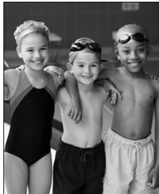
(above) Swim Lessons

The Gateway Family YMCA provides innovative 24-hour virtual program opportunities to meet the needs of every individual. These programs have become part of the fabric of every day opportunities, including group exercise programs, water safety education, mental health and skills seminars. Busy families and seniors can visit the Y, take a class online, or any combination of both. In person, the Y provides family and