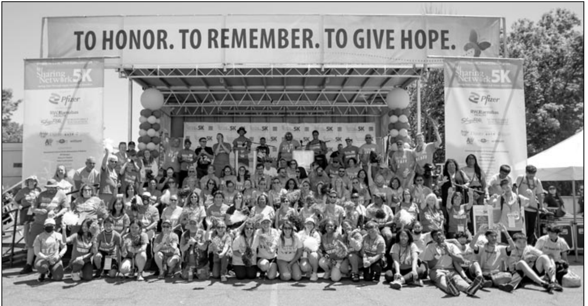
(above) NJ Sharing Network's 5K Celebration of Life Will Unite Thousands of Organ and Tissue Donation Supporters in New Providence on June 11. To sign up to participate in the 5K Celebration of Life or make a contribution to a team, visit SharingNetworkFoundation.org/5K .

According to United Network for Organ Sharing (UNOS), there are over 100,000 Americans – nearly 4,000 of whom live in New Jersey – waiting for a life-saving transplant. One organ and tissue donor can save eight lives and enhance the lives of over 75 others. To learn more, get involved, and join the National Donate Life Registry as an organ and tissue donor, visit NJSharingNetwork.org .