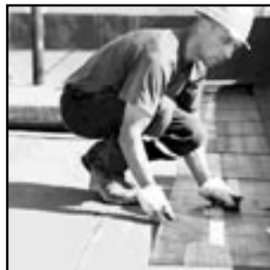
FLAT TOP ROOF