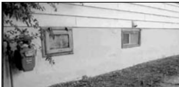
FOUNDATION REPAIRS BEFORE & AFTER