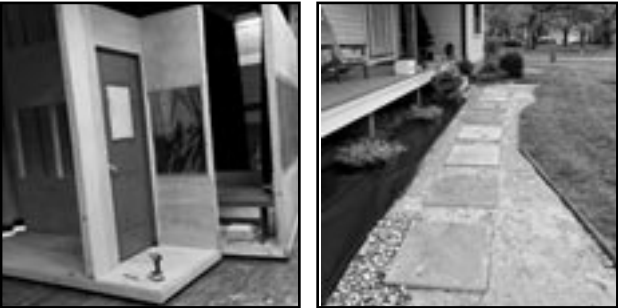
(above, l-r) Helping with Deerfield Play, Path Work