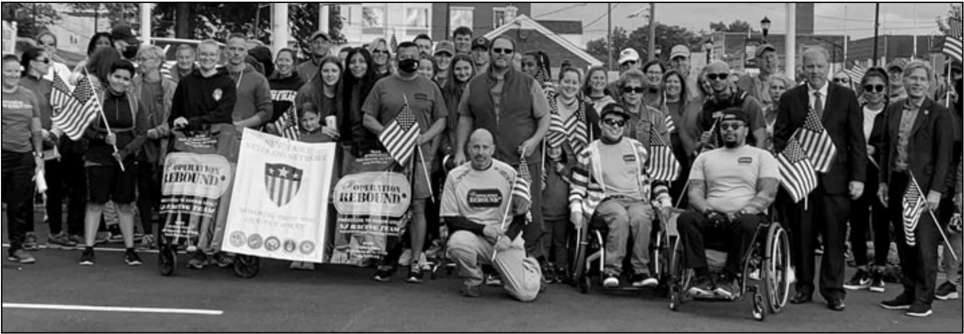
(above) New Jersey Veterans Network veterans and volunteers at a recent Memorial Day Parade.

supporting groups. In the next few months we are excited to be launching the "Uniformed Heroes Project," which is a statewide peer support/mentorship program for veterans, first responders, and active duty military. This project is a collaboration between the NJ VFW, NJ American Legion, NJ FMBA, PFANJ, NJSPBA, NJ FOP, NJ MAVA, NJ legislators, other military/first responder organizations. The Uniformed Heroes Project will provide peer support training throughout the state for volunteers and host numerous recreational therapy events for our heroes in need. ABOUT NEW JERSEY VETERANS NETWORK We are a group of veterans and volunteers dedicated to helping our veterans and their families live better lives. Our mission is to identify veterans and connect them with resources and programs designed to meet their unique set of needs. Help us save Vets! We are always looking for volunteers, with various skills, to join the team. If you are a veteran or family member that's in need of assistance; or are interested in volunteering, would like us to speak at your event, or contribute to our mission, call 973-332-1556 or email njvn1775@gmail.com . To learn more about the team please check out our website njvn.org (accomplishments). Help us save Vets!