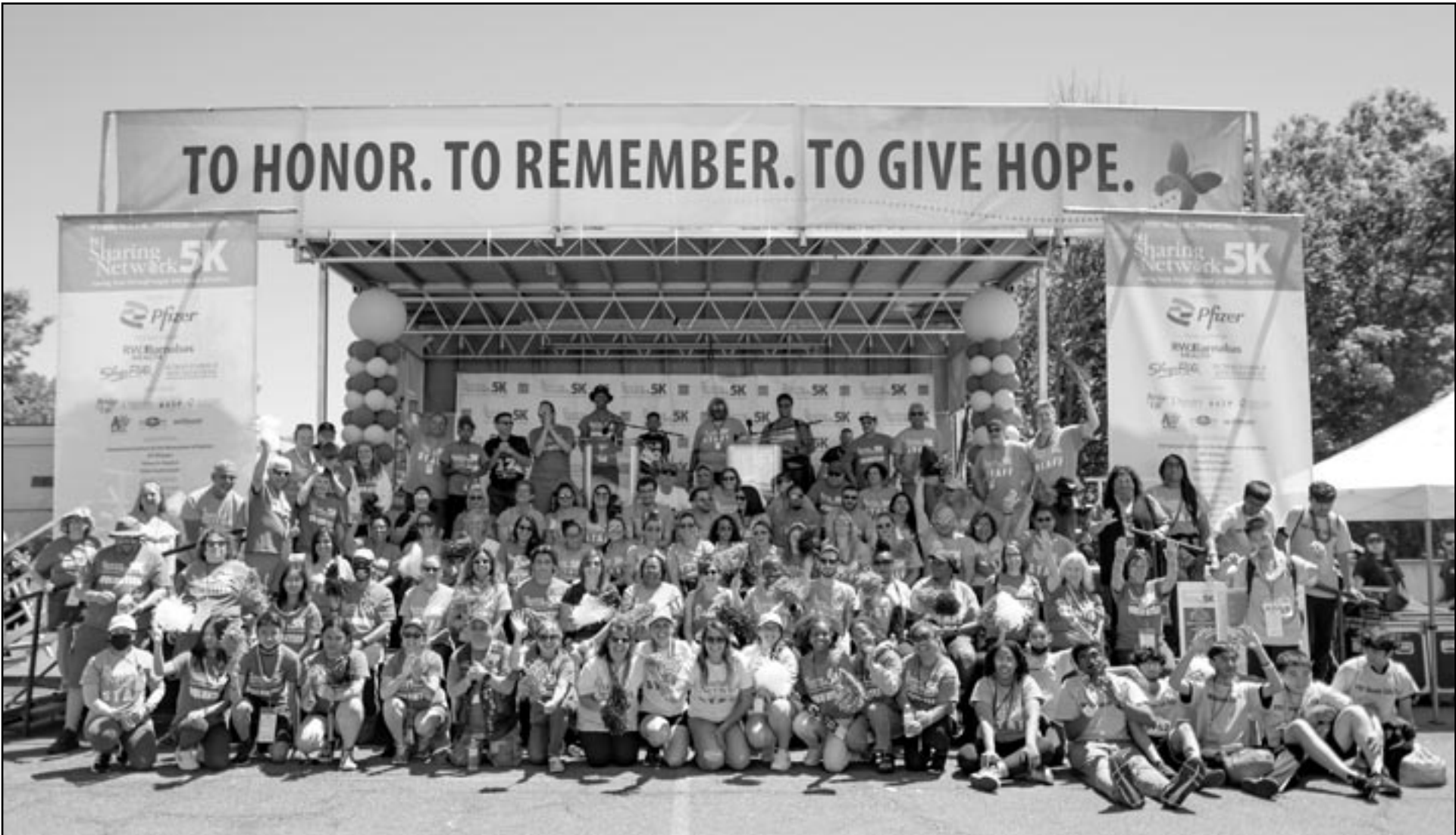
(above) NJ Sharing Network’s 5K Celebration of Life Will Unite Thousands of Organ and Tissue Donation Supporters in New Providence on June 11. To sign up to participate in the 5K Celebration of Life or make a contribution to a team, visit SharingNetworkFoundation.org/5K .

According to United Network for Organ Sharing (UNOS), there are over 100,000 Americans – nearly 4,000 of whom live in New Jersey – waiting for a life-saving transplant. One organ and tissue donor can save eight lives and enhance the lives of over 75 others. To learn more, get involved, and join the National Donate Life Registry as an organ and tissue donor, visit NJSharingNetwork.org .