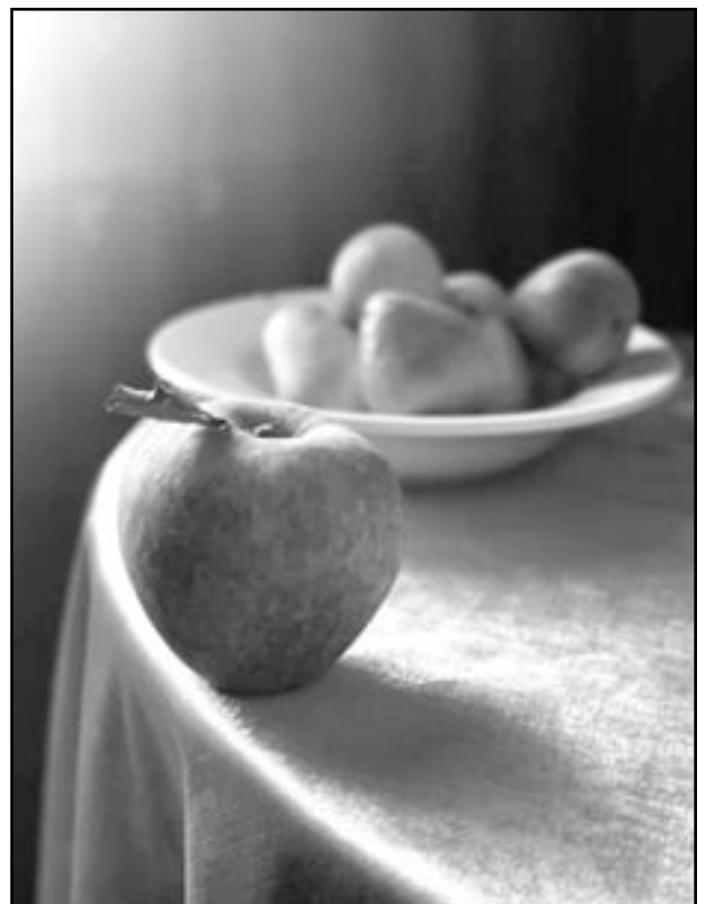
(above) Still Life with Autumn Fruit