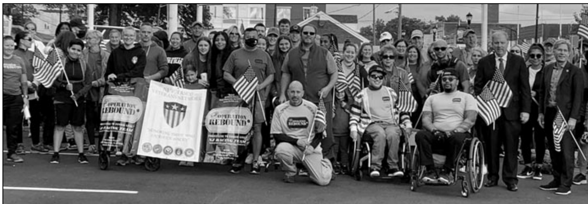
(above) New Jersey Veterans Network veterans and volunteers at a recent Memorial Day Parade.

If you are a veteran or family member that's in need of assistance; or are interested in volunteering, would like us to speak at your event, or contribute to our mission, call 973-332-1556 or email njvn1775@gmail.com To learn more about the team please check out our website njvn.org (accomplishments). Help us save Vets!