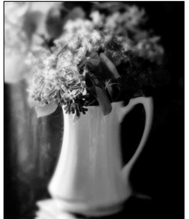
(above) Spring Lilacs