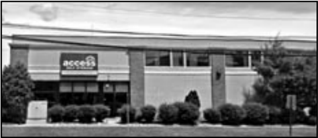
(above) Pond was located behind Access Storage.