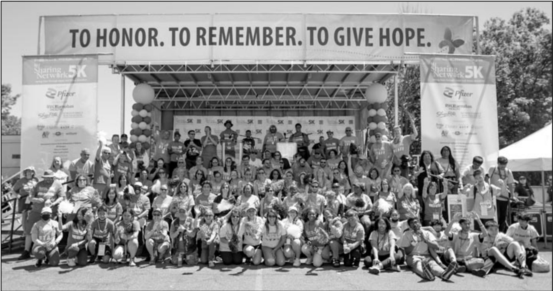
(above) NJ Sharing Network’s 5K Celebration of Life Will Unite Thousands of Organ and Tissue Donation Supporters in New Providence on June 11. To sign up to participate in the 5K Celebration of Life or make a contribution to a team, visit SharingNetworkFoundation.org/5K .

According to United Network for Organ Sharing (UNOS), there are over 100,000 Americans – nearly 4,000 of whom live in New Jersey – waiting for a life-saving transplant. One organ and tissue donor can save eight lives and enhance the lives of over 75 others. To learn more, get involved, and join the National Donate Life Registry as an organ and tissue donor, visit NJSharingNetwork.org .