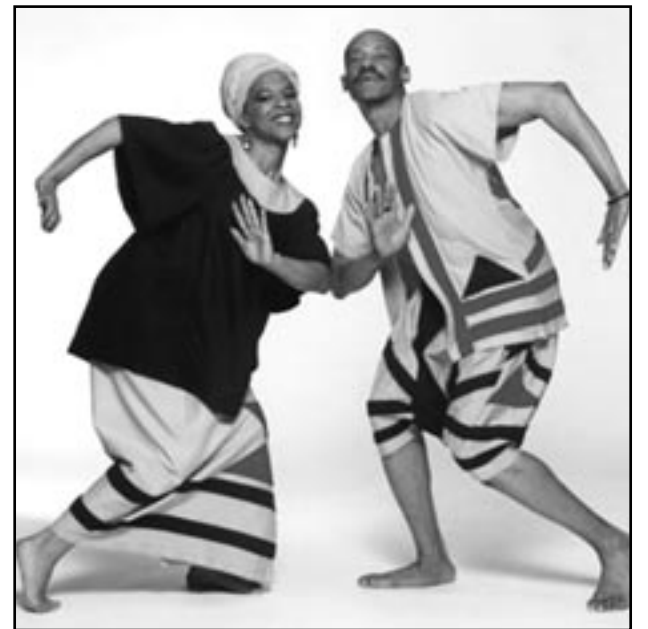
(above) Journey To Africa: 7:00pm – 8:00pm on Thursday, June 15