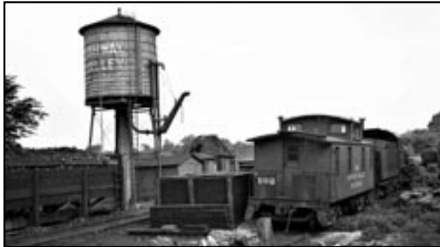
(above) Pond supplied water for railroad water tower.