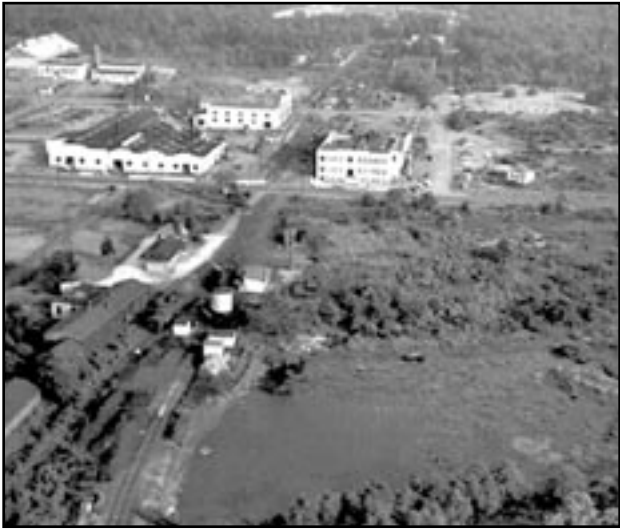
(above) Station Pond lower right, 1949. Acme Mall upper left today.