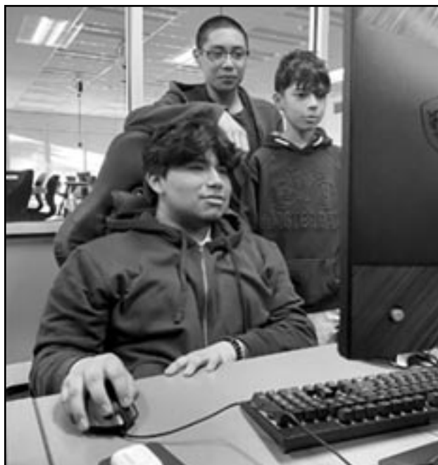
(above) Mind games: Esports programs develop skills at Kenilworth schools