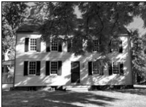
(above) The Dr. John Vermeule House