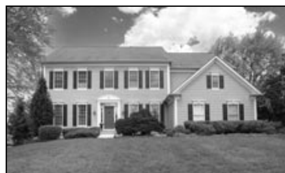
UNDER CONTRACT 26 RIDGE RD, GREEN BROOK 5 Bed / 4.1 Bath / 2 Car Garage Newly updated kitchen & bath