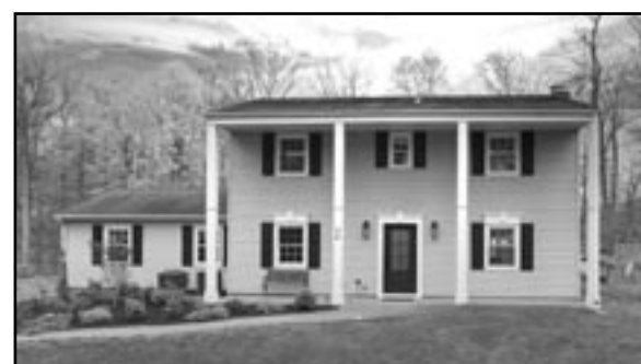
UNDER CONTRACT 24 GREEN VALLEY DR, GREEN BROOK 4 Bed / 2.1 Bath / 2 Car Garage Gorgeous home w/heated in-ground pool