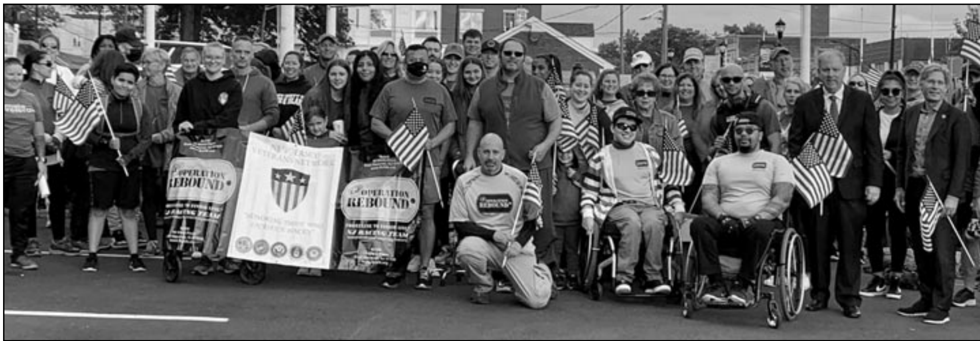
(above) New Jersey Veterans Network veterans and volunteers at a recent Memorial Day Parade.

If you are a veteran or family member that's in need of assistance; or are interested in volunteering, would like us to speak at your event, or contribute to our mission, call 973-332-1556 or email njvn1775@gmail.com . To learn more about the team please check out our website njvn.org (accomplishments). Help us save Vets!