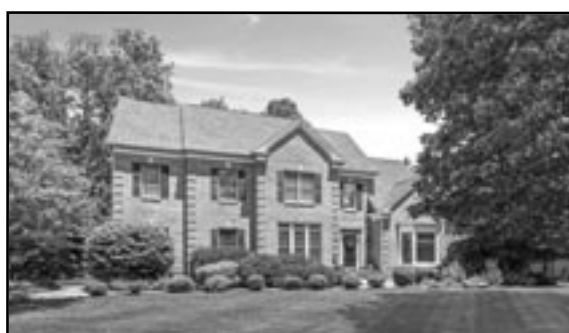
UNDER CONTRACT 38 RIDGE RD, GREEN BROOK 4 Bed / 4.1 Bath / 3 Car Garage Elegant home w/finished basement