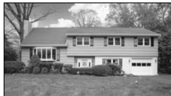
UNDER CONTRACT 30 ABBY LANE, GREEN BROOK 5 Bed / 2.1 Bath / 1 Car Garage Meticulously maintained home w/in-ground pool