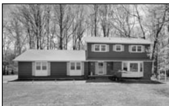
FOR SALE 21 BLUE RIDGE AVE, GREEN BROOK 5 Bed / 2.1 Bath / 2 Car Garage Newly updated kitchen & bath