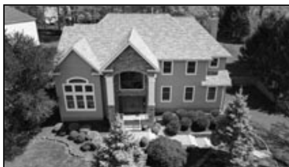
UNDER CONTRACT 5 SCHEURMAN TERRACE, GREEN BROOK 5 Bed / 4.1 Bath / 3 Car Garage Spectacular views