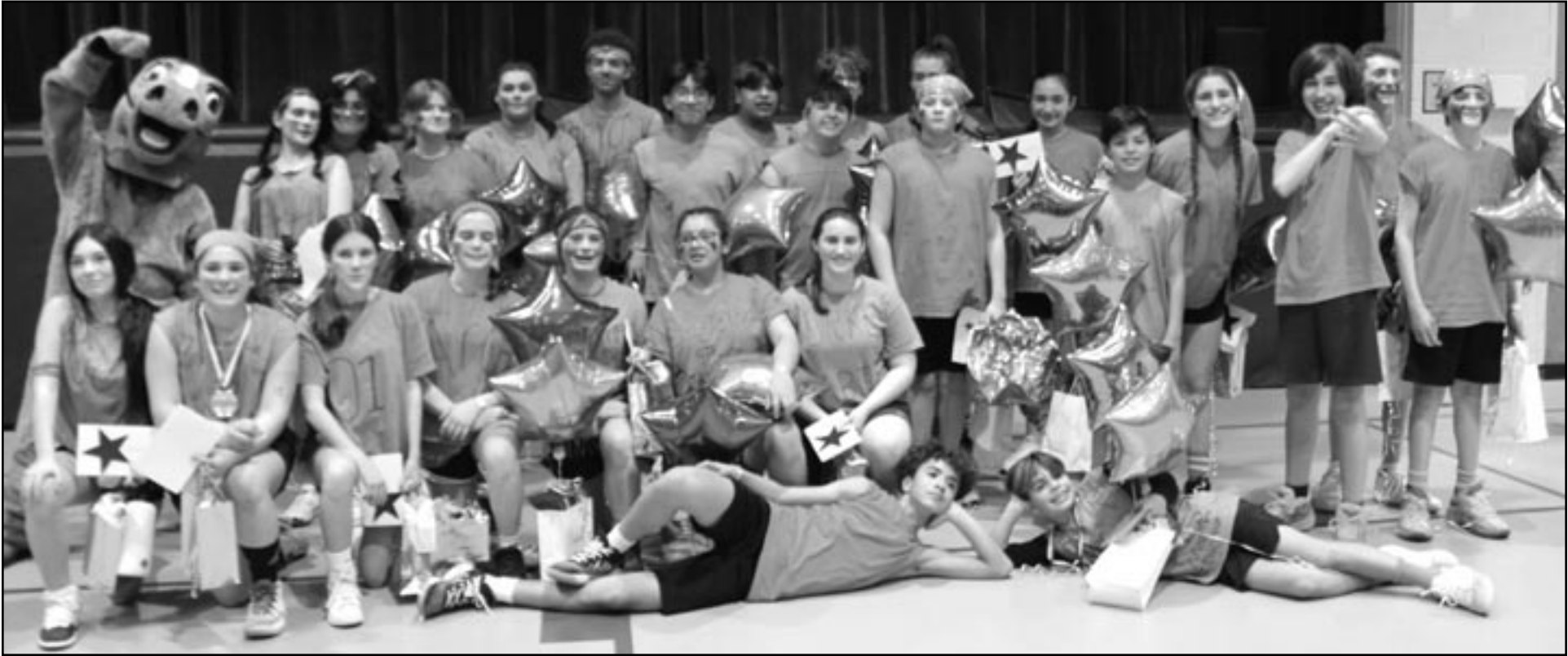
(above) Garwood Mustangs