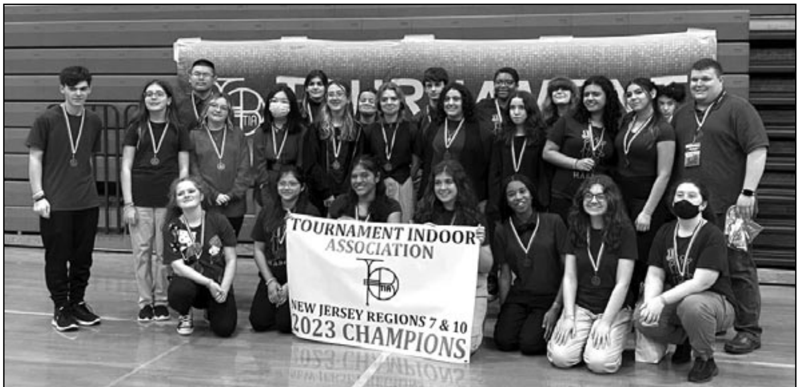
(above) The ALJ High School Indoor Percussion and Color Guard