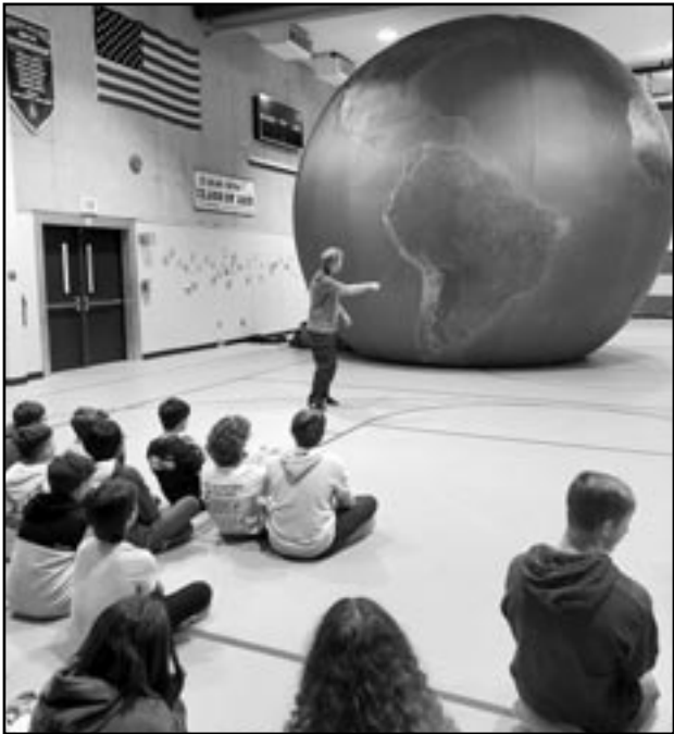
(above) The Earth Dome