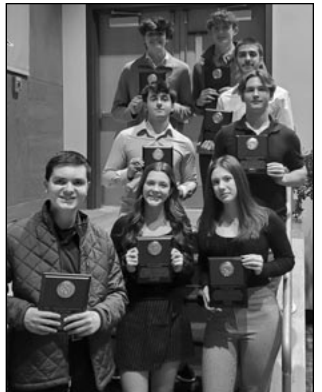
(above) Winter Best Teammate Award