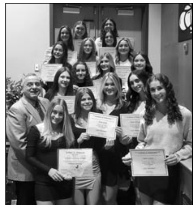
(above) Winter G.P.A. Challenge Winners Girls’ Basketball