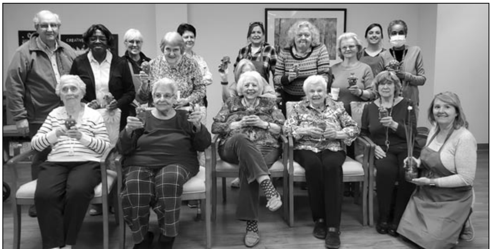
(above) The senior citizens living at Village at Garwood recently enjoyed a program presented by the Union County Master Gardeners.