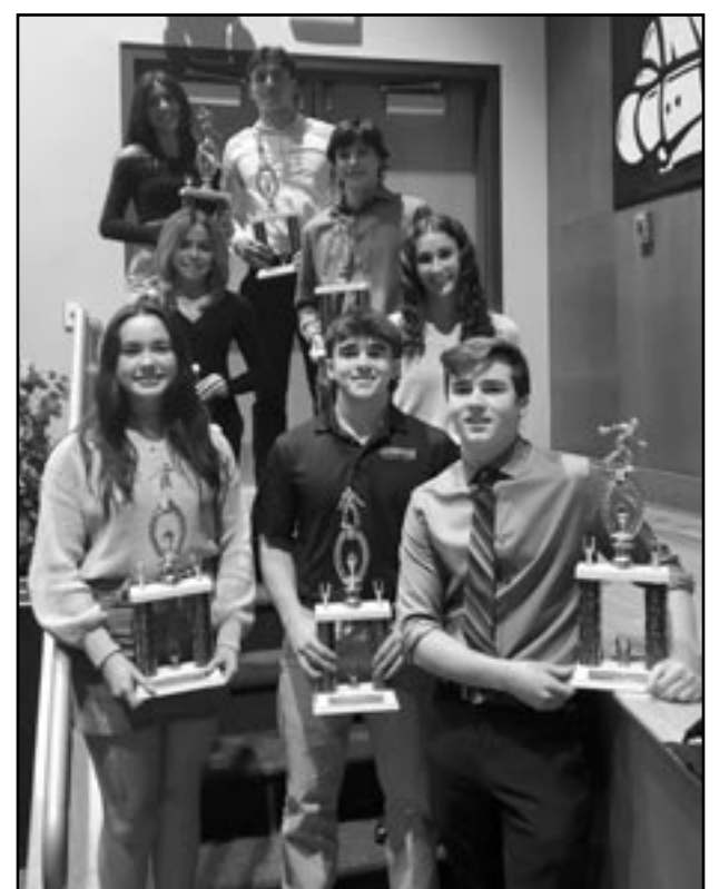
(above) Winter Most Valuable Players