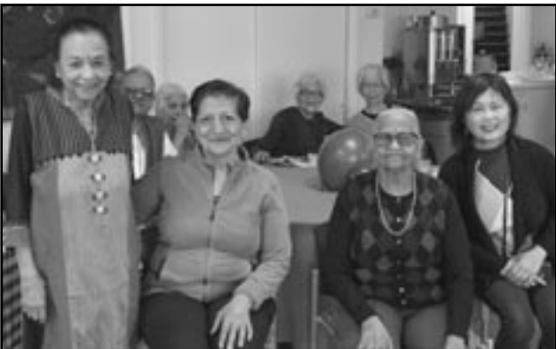
Photos from this and other events can be found online at rennamedia.com and on the Warren Monthly page on facebook.com . Feel free to “Like,” “Tag,” and “Share.”