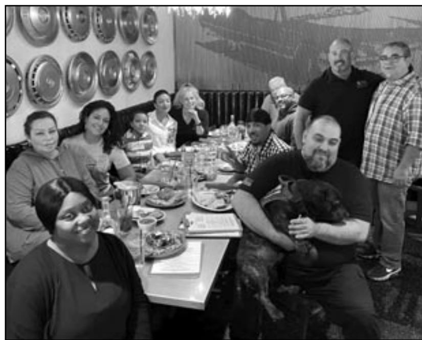
(above) The Red Cadillac during a recent helping to feed veterans event.

If you are interested in joining the team, please send me your name, email and phone number to NJVN1775@gmail.com or call us at (973) 332-1556