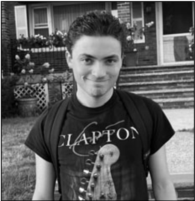
(above) Whether you have autism, love someone who does, or are looking to support a diverse, accepting and kind community – you're invited to take the pledge to help create a world where all people with autism can reach their full potential. For more information visit: autismspeaks.org/world-autism-awareness-day

For more information visit: autismspeaks.org/world-autism-awareness-day