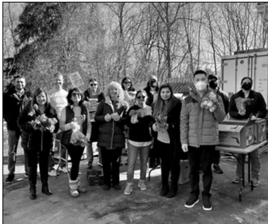
(above) The Interfaith Food Pantry Network (IFPN) is the largest and most relied upon resource for emergency and supplemental food among Morris County residents in need.

Proceeds from Sustaining Hope will be used to fund IFPN Healthy Choices Marketplaces and Mobile Network programs providing healthy food to the ever-growing number of families facing food insecurity and hunger throughout