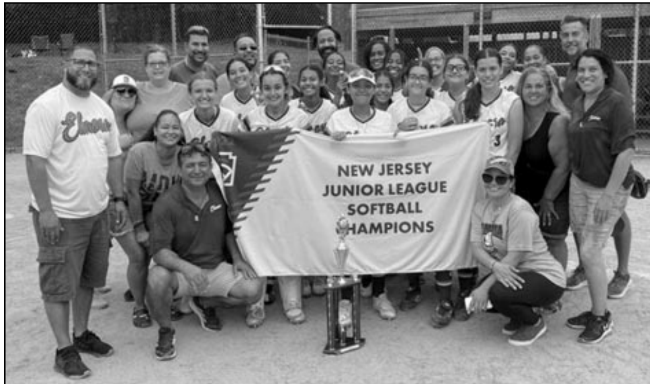
(above) 2021 Elmora Senior League State Champs & 2022 Junior League State Champs