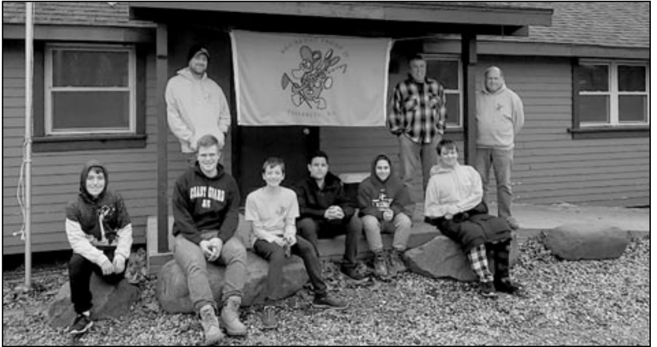
(above) Scouts of Troop 23, Elizabeth, spent a cold weekend in February in Beech Cabin in William H. Pouch Scout Camp on Staten Island.