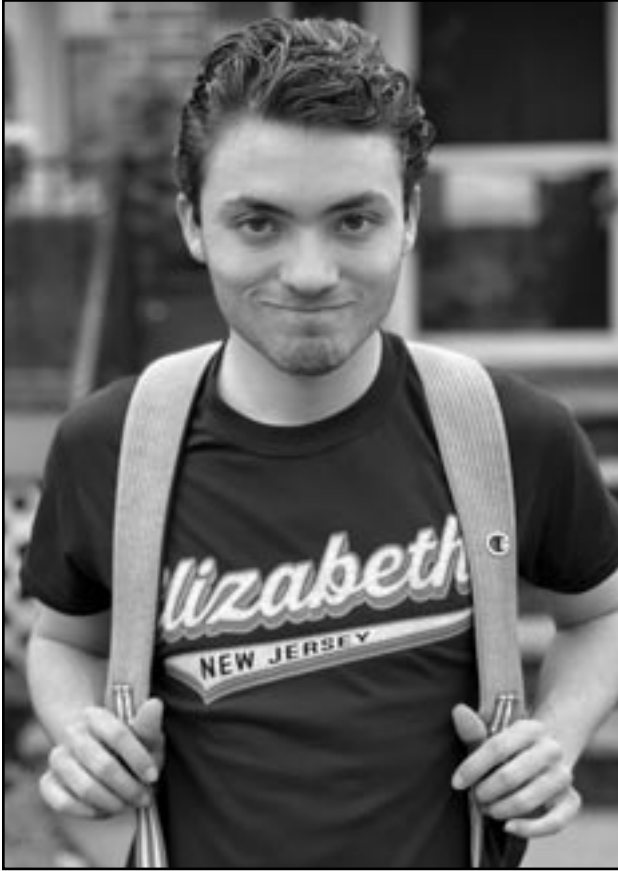
(above) Whether you have autism, love someone who does, or are looking to support a diverse, accepting and kind community – you’re invited to take the pledge to help create a world where all people with autism can reach their full potential. For more information visit: autismspeaks.org/world-autism-awareness-day

Throughout the month, we focus on sharing stories and providing opportunities to increase understanding and acceptance of people with autism, fostering worldwide support. This year, we are committed to creating a world where all people with autism can reach their full potential.