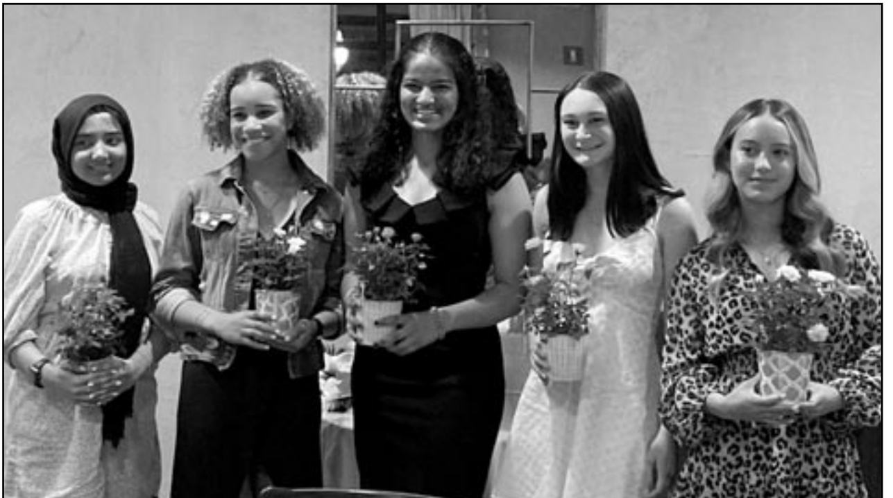
(above) 2022 Scholarship winners.