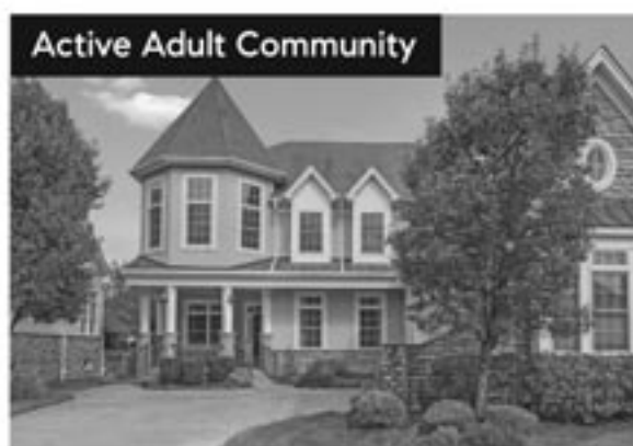
33 Johns Road, Warren, NJ 3 Bed | 4 Bath | 1 Half Bath | $1,100,000