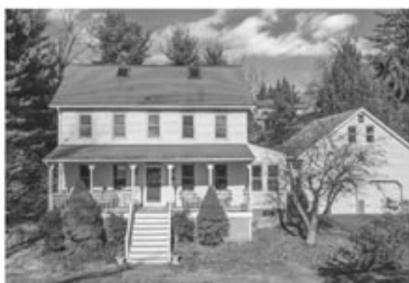
61 Reinman Road, Warren, NJ 4 Bed | 3 Bath | $624,000