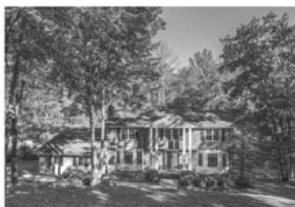
103 Smoke Rise Drive, Warren, NJ 4 Bed | 2 Bath | 1 Half Bath | $800,000