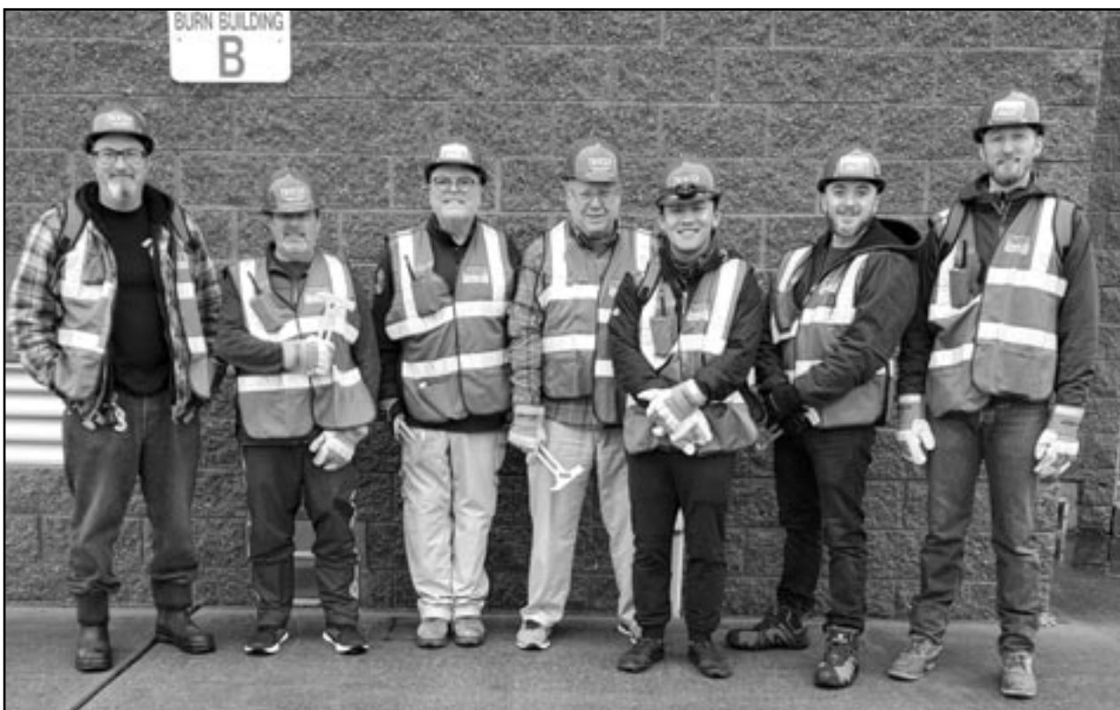
(above) Somerset County's November CERT training graduated additional volunteers ready to jump into action to protect neighbors and free up first-responders when disaster strikes their local communities.

For more information regarding the CERT program, please utilize the following link: bit.ly/SoCoCERT