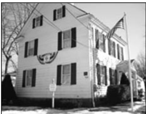
(above) Caldwell Parsonage Open Houses hosted by the Union Township Historical Society; Sundays, February 12 and 26, 2-5 p.m.