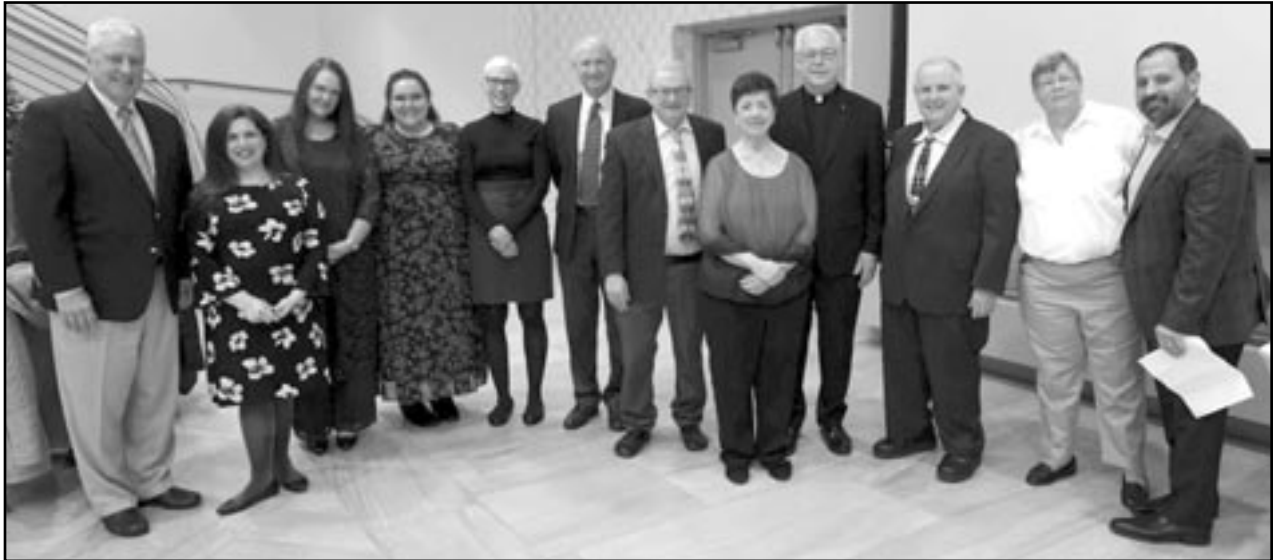
(above) The Scotch Plains Rescue Squad swore in new officers and commended members on their years of service at their annual Installation Dinner.