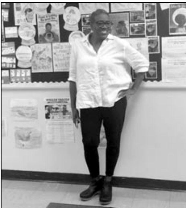
(above) Coles staff and students welcomed two author for visits this December.

The Coles PTA was very excited to offer an in person visit after such a long hiatus.