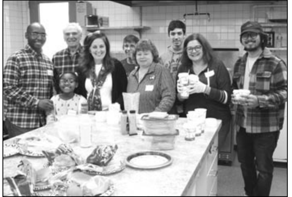
(above) Immaculate Heart of Marcy Church in Scotch Plains hosted a Bingo luncheon for approximately 95 senior citizens.