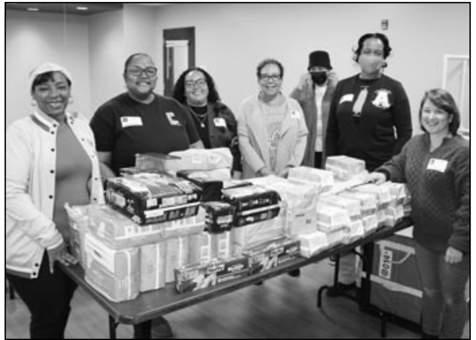
(above) A 'Dignity Drive' was sponsored by the Alpha Kappa Alpha Sorority.