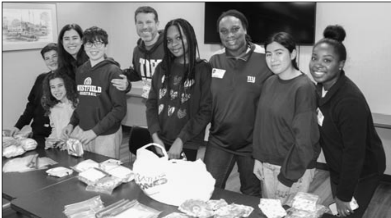
(above) Hope for Health & Hygiene collected basic hygiene products to be distributed.