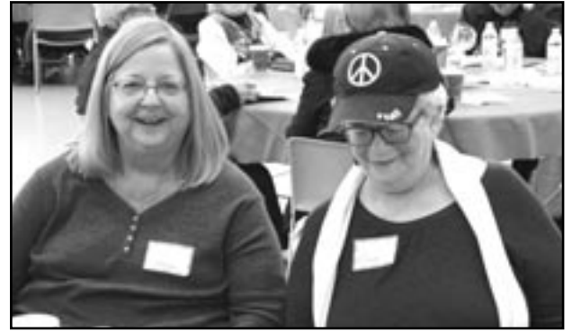
(above) Immaculate Heart of Marcy Church in Scotch Plains hosted a Bingo luncheon for approximately 95 senior citizens.