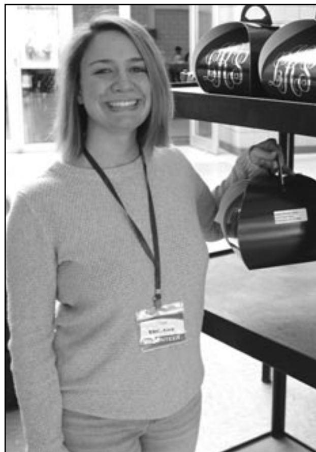
(above) Volunteers delivered 105 food boxes to homebound seniors and delivered 105 food boxes to homebound seniors.