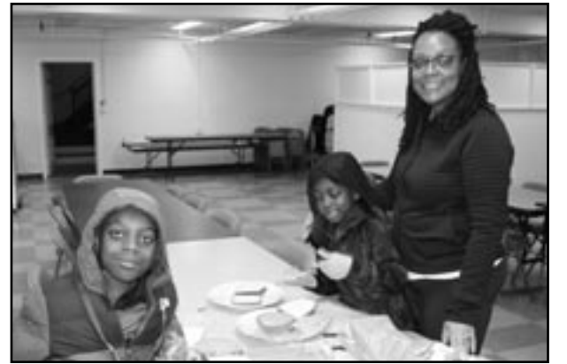
(above) Volunteers made sandwiches at Willow Grove Presbyterian Church in Scotch Plains.