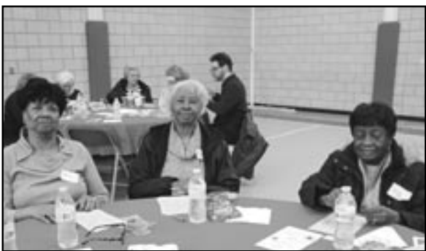
(above) Immaculate Heart of Marcy Church in Scotch Plains hosted a Bingo luncheon for approximately 95 senior citizens. Also, in conjunction with All Saints' Episcopal Church, volunteers delivered 105 food boxes to homebound seniors.