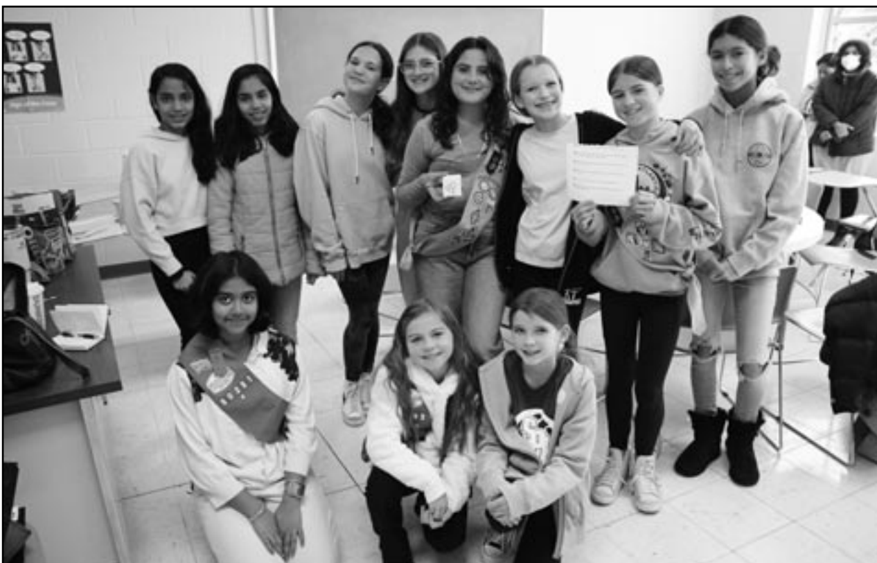
(above) At the YMCA Scotch Plains Girl Scout troop #40053 made inspirational 'Quote Boxes' to be distributed to hospitalized children.

Photos from this and other events can be found online at rennamedia.com and on Scotch Plains Monthly page on facebook.com . Feel free to "Like," "Tag," and "Share."