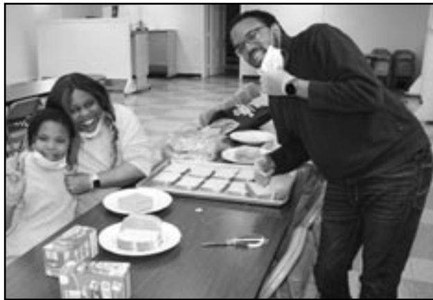
(above) Volunteers made sandwiches at Willow Grove Presbyterian Church in Scotch Plains.

Photos from this and other events can be found online at rennamedia.com and on Scotch Plains Monthly page on facebook.com Feel free to "Like," "Tag," and "Share."