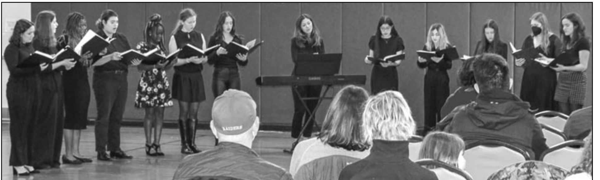
(above) Opening Ceremony at The JCC of Central New Jersey included a Choir

Photos from this and other events can be found online at rennamedia.com and on Scotch Plains Monthly page on facebook.com Feel free to "Like," "Tag," and "Share."