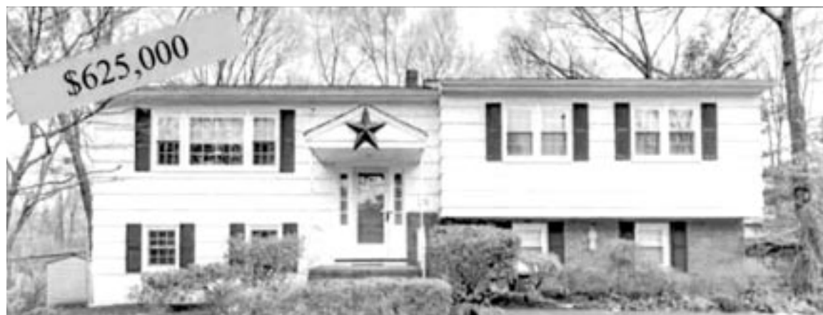
205 Robin Hood Road