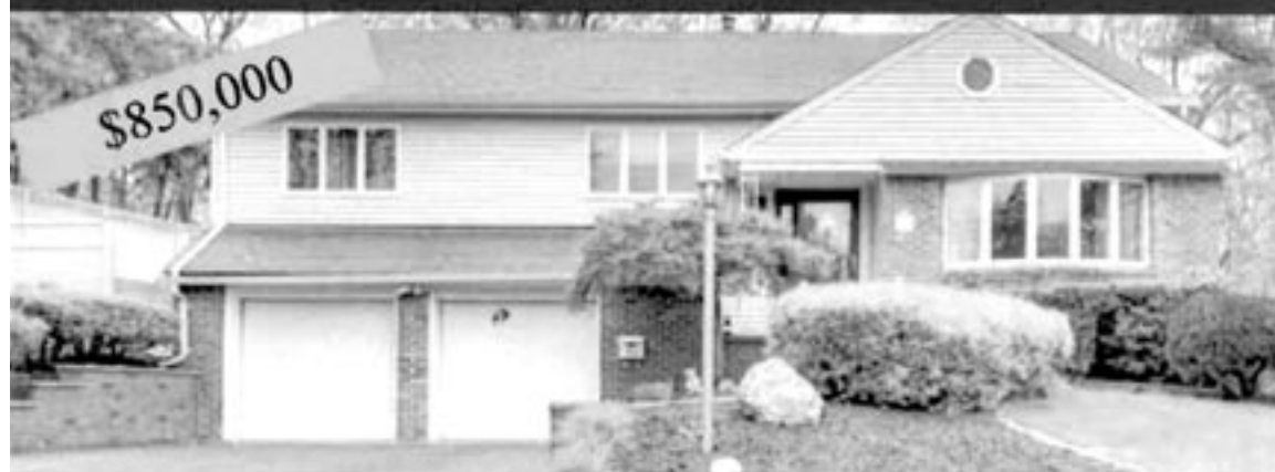
278 Ravenswood Road