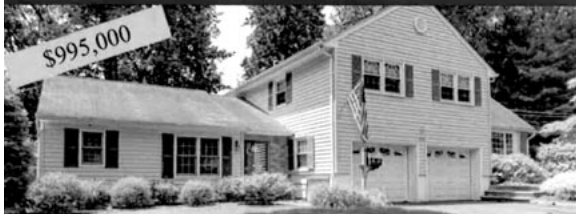
315 Rolling Rock Road