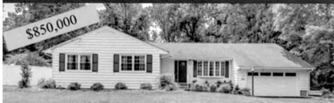
253 Holly Hill