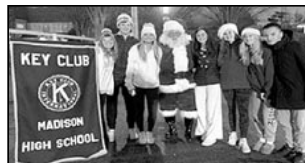
(above) The Madison High School Key Club along with members of the Kiwanis Club.

ornaments come individually boxed with a gift tag that lets the recipient know that their gift funded seventeen meals for the hungry in the Chatham/Madison area.