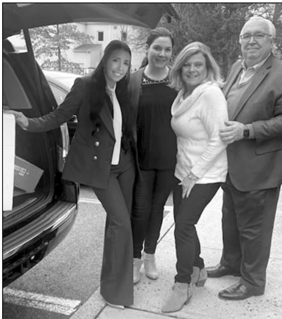
(above) Staff at ERA Boniakowski Real Estate participated in Toys for Tots and #Giving Tuesday this year, collecting toys for community children for the holidays.

ERA Boniakowski Real Estate is located at 929 N. Washington Avenue, Green Brook, NJ, 732-968-0700, and serves the entire Central New Jersey area west to the Delaware River with residential and commercial real estate.