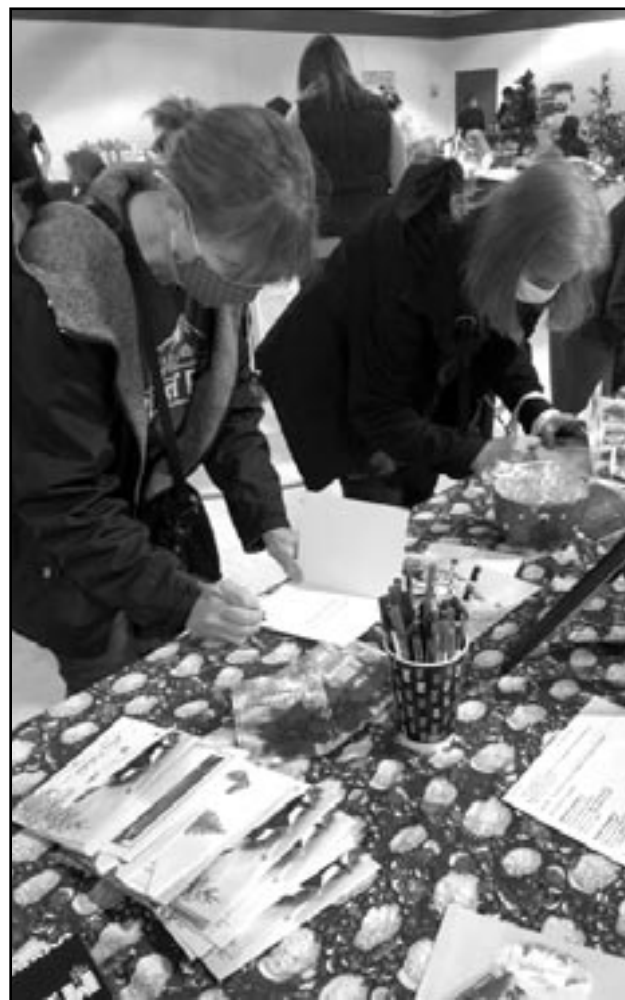
(above) Attendees sign cards for veterans at the 2021 4-H Holiday Craft Festival.