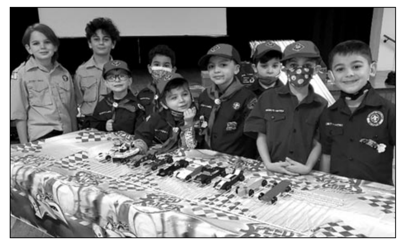
(above) Cub Scouts from Pack 23 show off the cars they built for the 2022 Pinewood Derby.

The Scouting program at St. Genevieve's Church teaches character, citizenship and