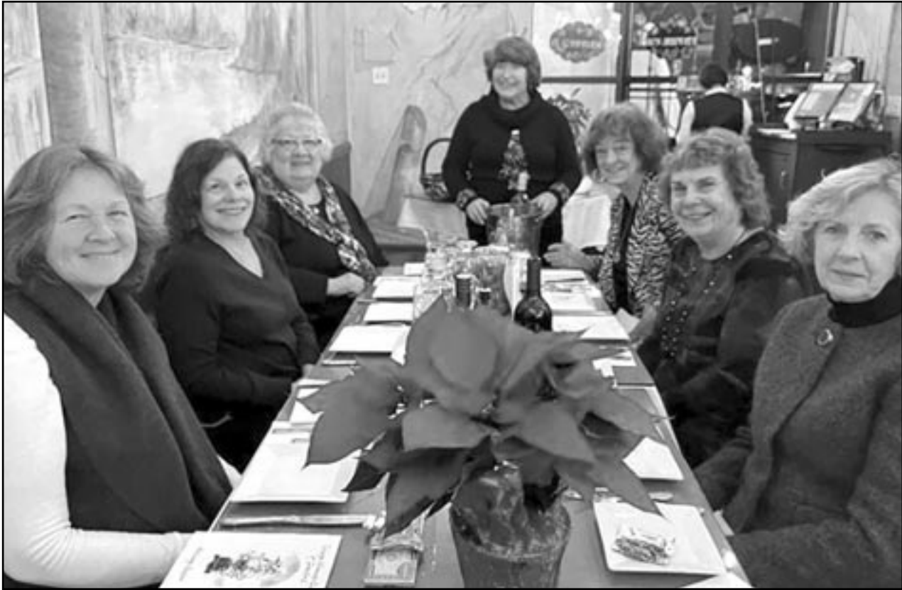
(above) The College Women’s Club of Cranford celebrated the holidays in style at Il Gabbiano.