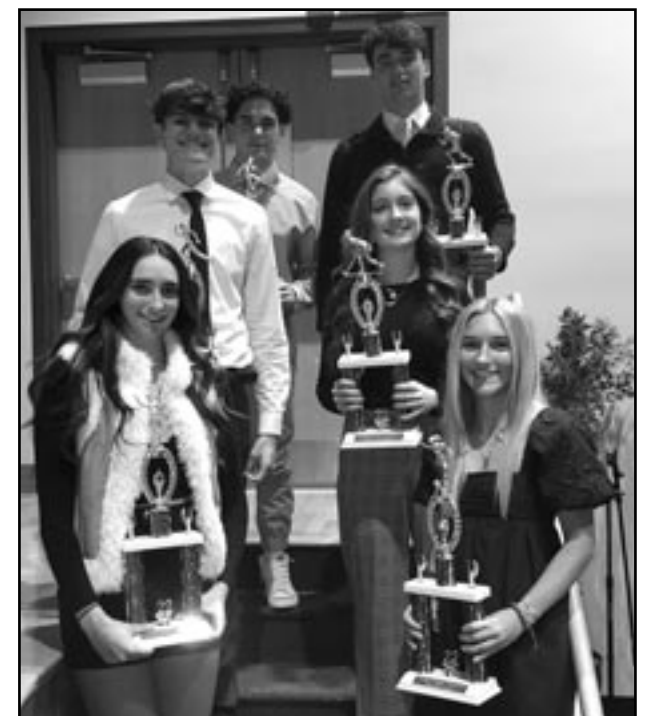
(above) 2022 Fall MVPs.