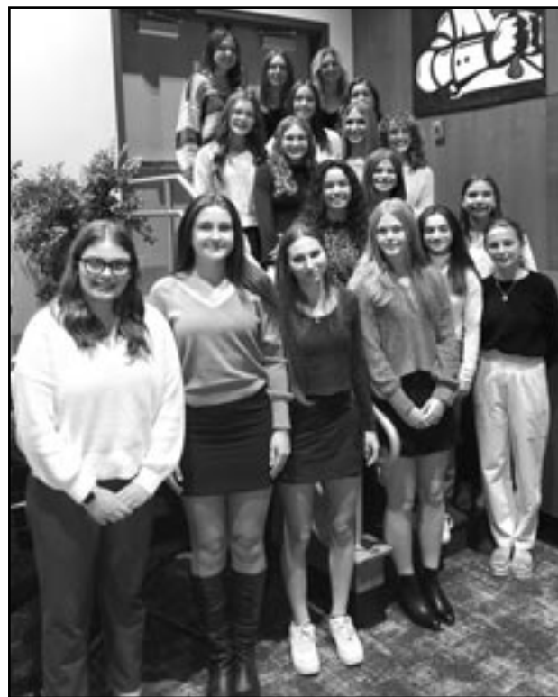
(above) 2022 Fall G.P.A. Winners – ALJ Field Hockey Program.