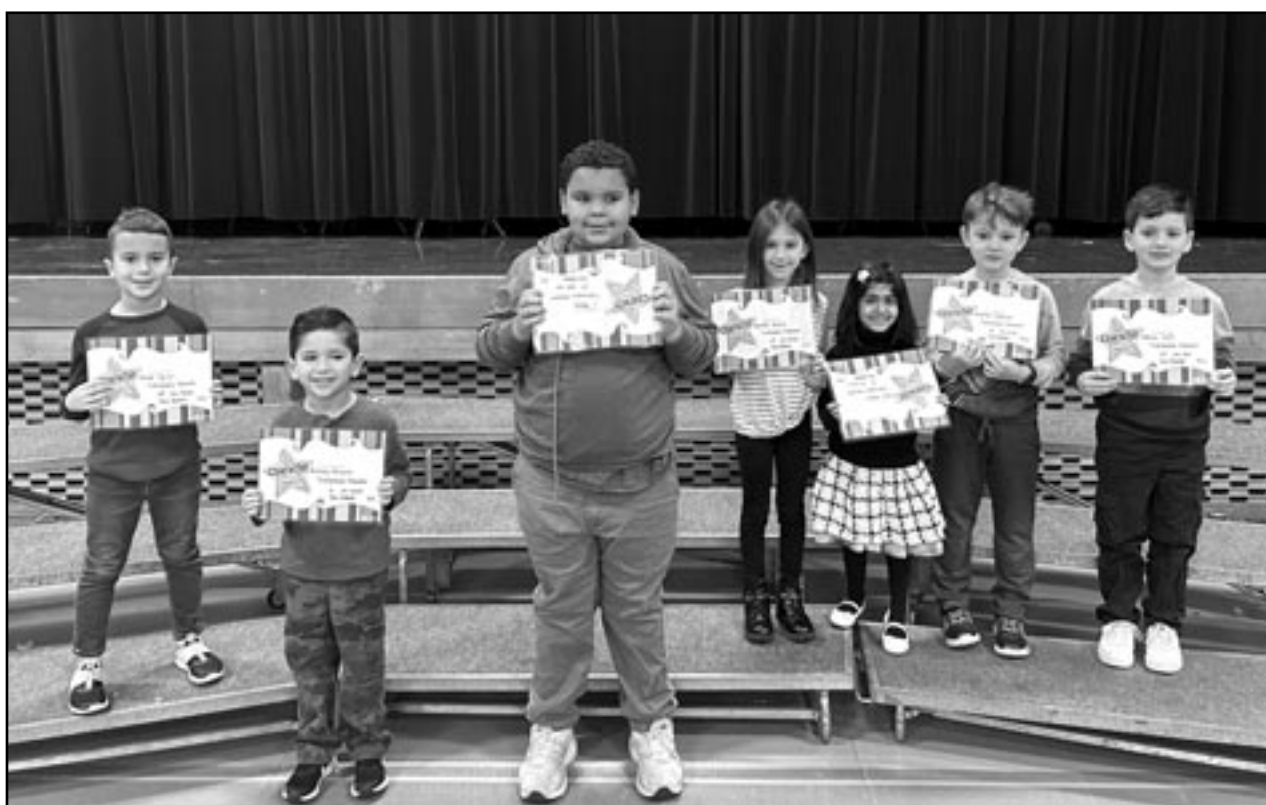
(above) Students at Valley Road School pictured with their "Tree"mendous Character Awards.