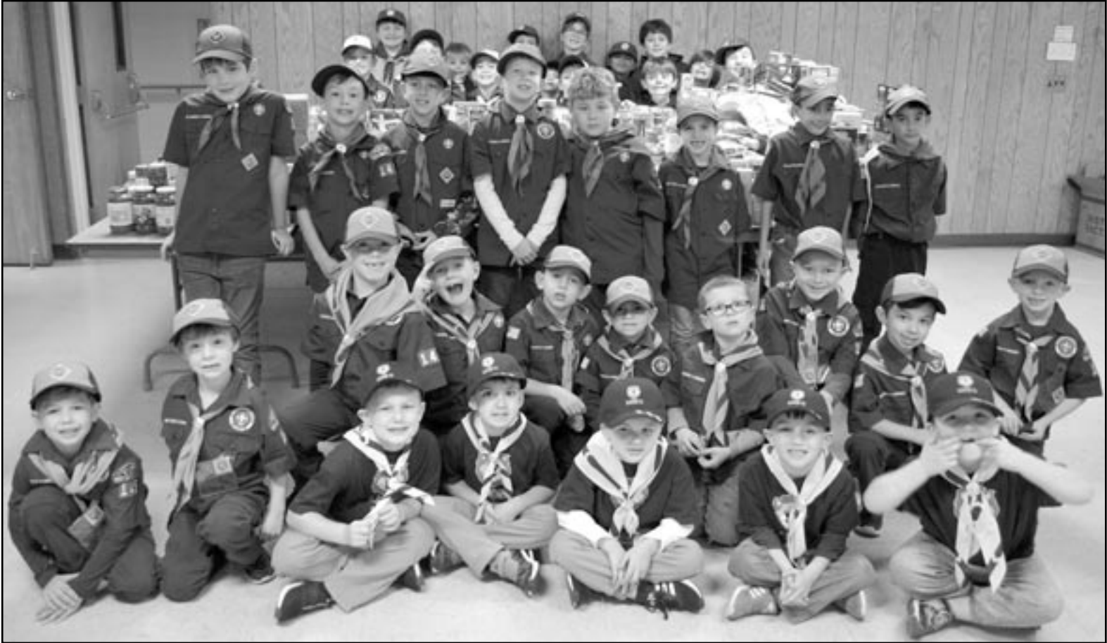
(above) Cub Scout Pack 145 successfully participated in the annual Scouting for Food program.