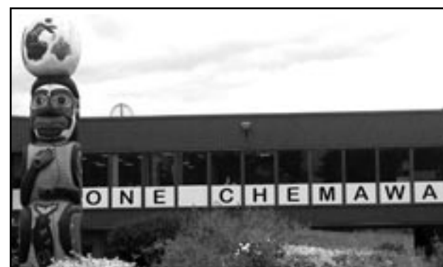
(above) Chemawa Indian School is one of several schools around the country serving disadvantaged or special needs students that receive financial and material support from the DAR.

Chemawa Indian School is one of several schools around the country serving disadvantaged or special needs students that receive financial and material support from the DAR. The DAR is a nonprofit service organization for women 18 and over who are descended from a Revolutionary War patriot. Learn more at www.DAR.org .