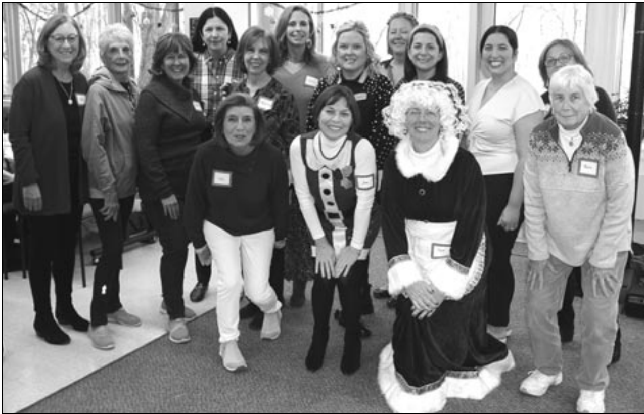
(above) Senior Center of the Chathams, employees, volunteers, and sponsors of the event.