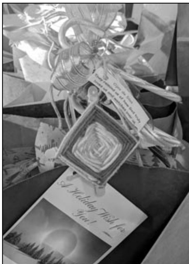
(above) Some of the gifts at the altar of Faith. The confirmation classes, grades 6 through 8, beautifully packaged the gifts, which included a candy cane and card.