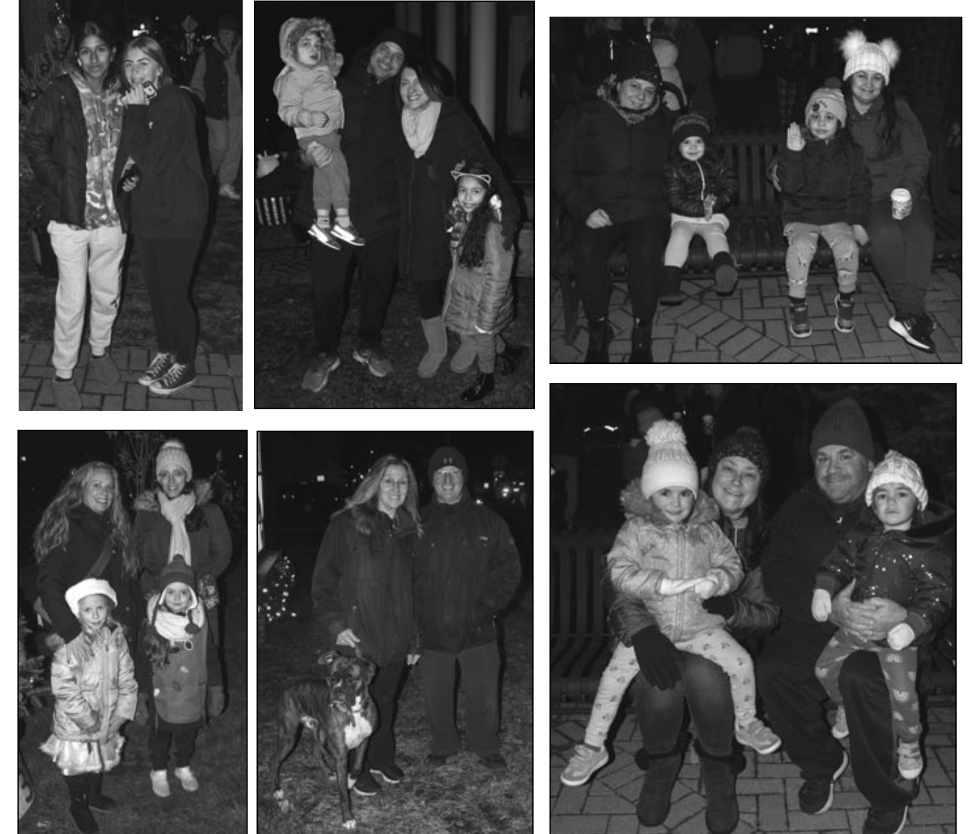
Photos from this and other events can be found online at rennamedia.com and on the Kenilworth Business Life page on facebook.com. Feel free to "Like," "Tag," and "Share."