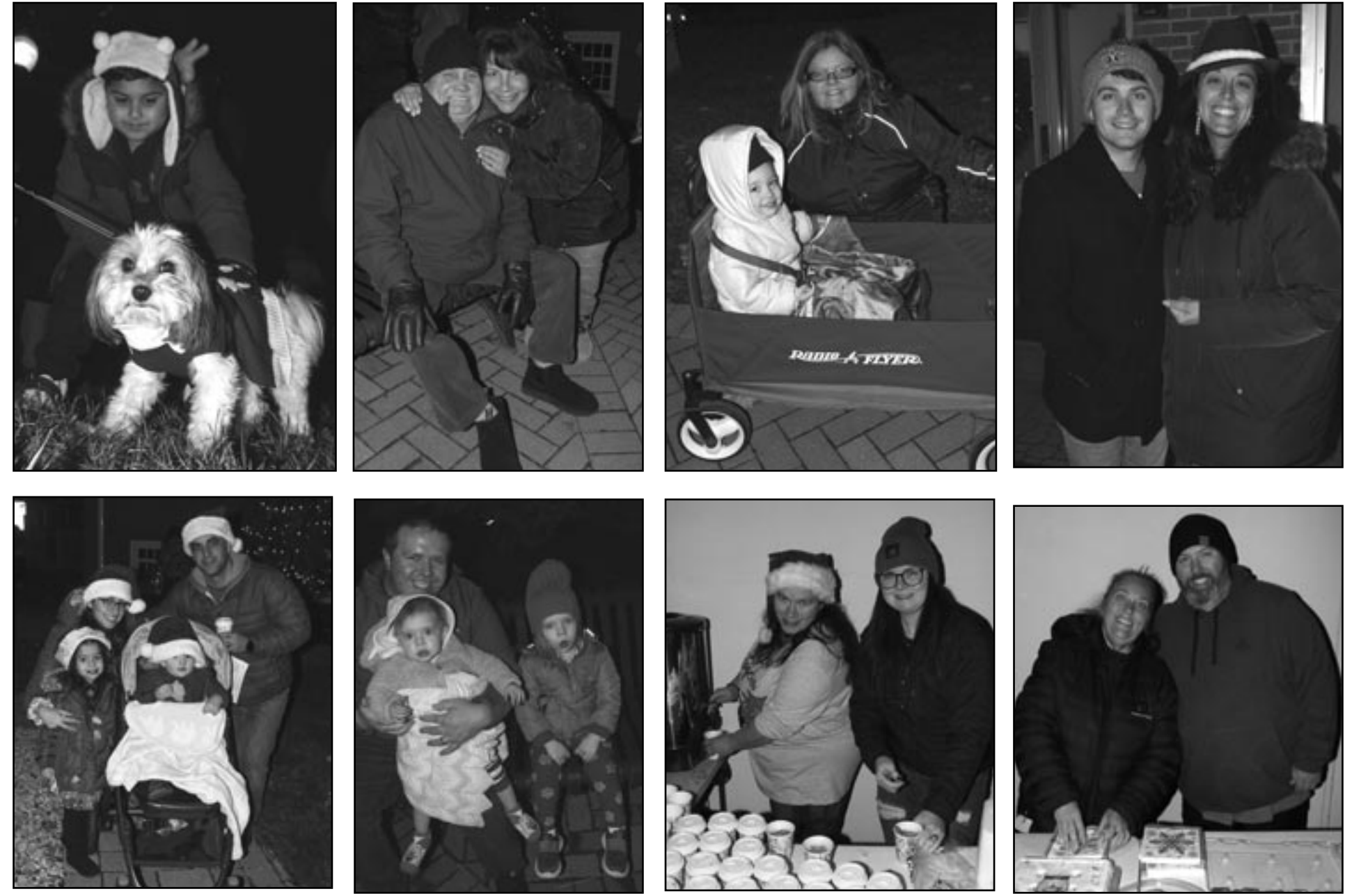
Photos from this and other events can be found online at rennamedia.com and on the Kenilworth Business Life page on facebook.com. Feel free to "Like," "Tag," and "Share."