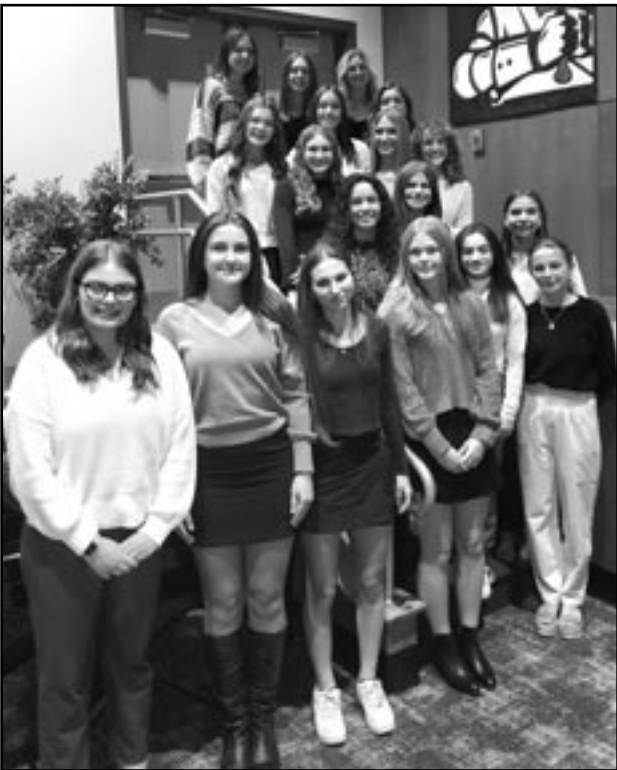
(above) 2022 Fall G.P.A. Winners – ALJ Field Hockey Program.