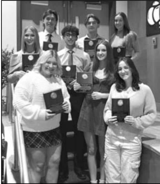
(above) 2022 Fall Best Teammate Award winners.