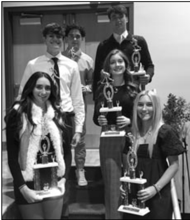
(above) 2022 Fall MVPs.