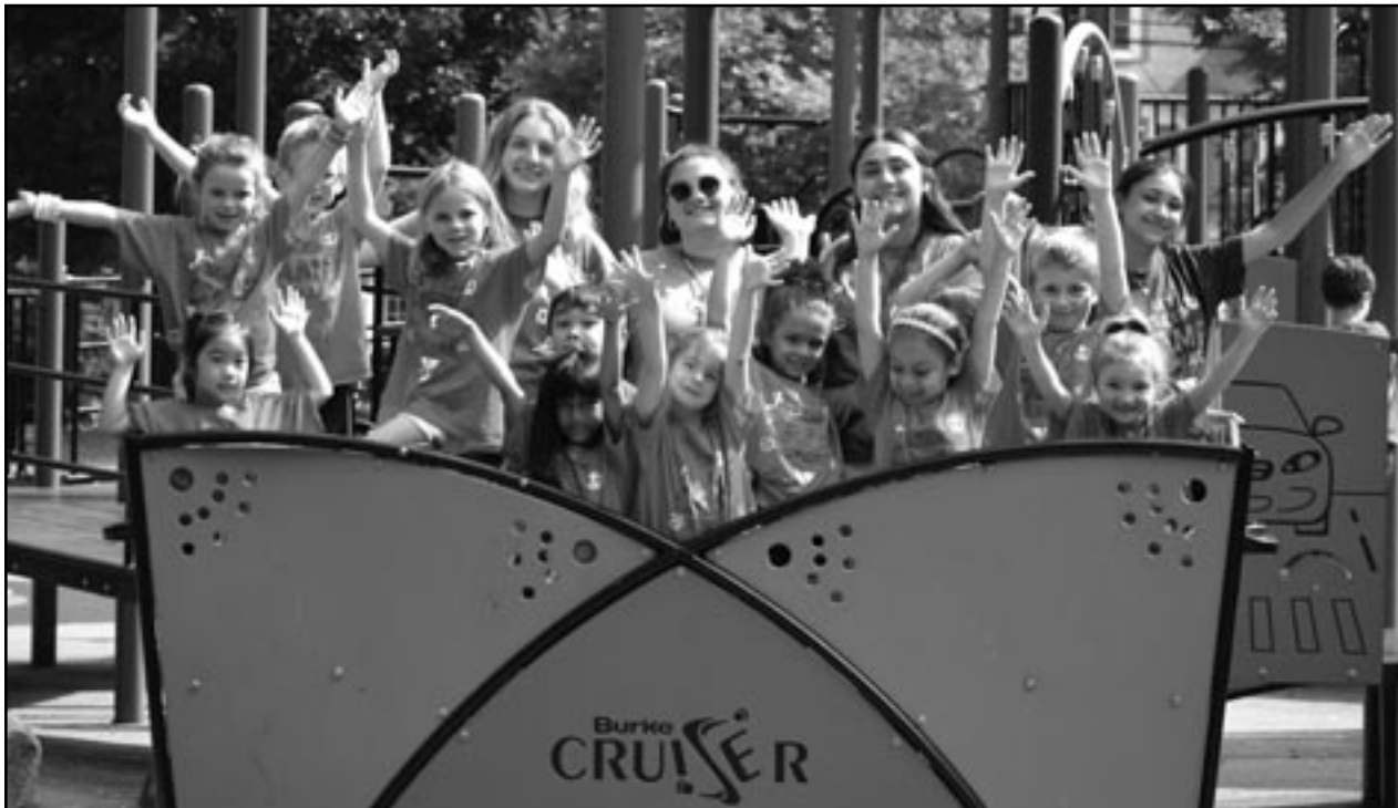
(above) Westfield Area YMCA campers enjoy a trip to Mindowaskin Park.

For information on all Westfield Area YMCA programs and services, visit westfieldynj.org or call the Welcome Center at 908-301-YMCA (9622). The Y is for youth development, healthy living and social responsibility. Financial assistance is available for YMCA programs and memberships for those who qualify.