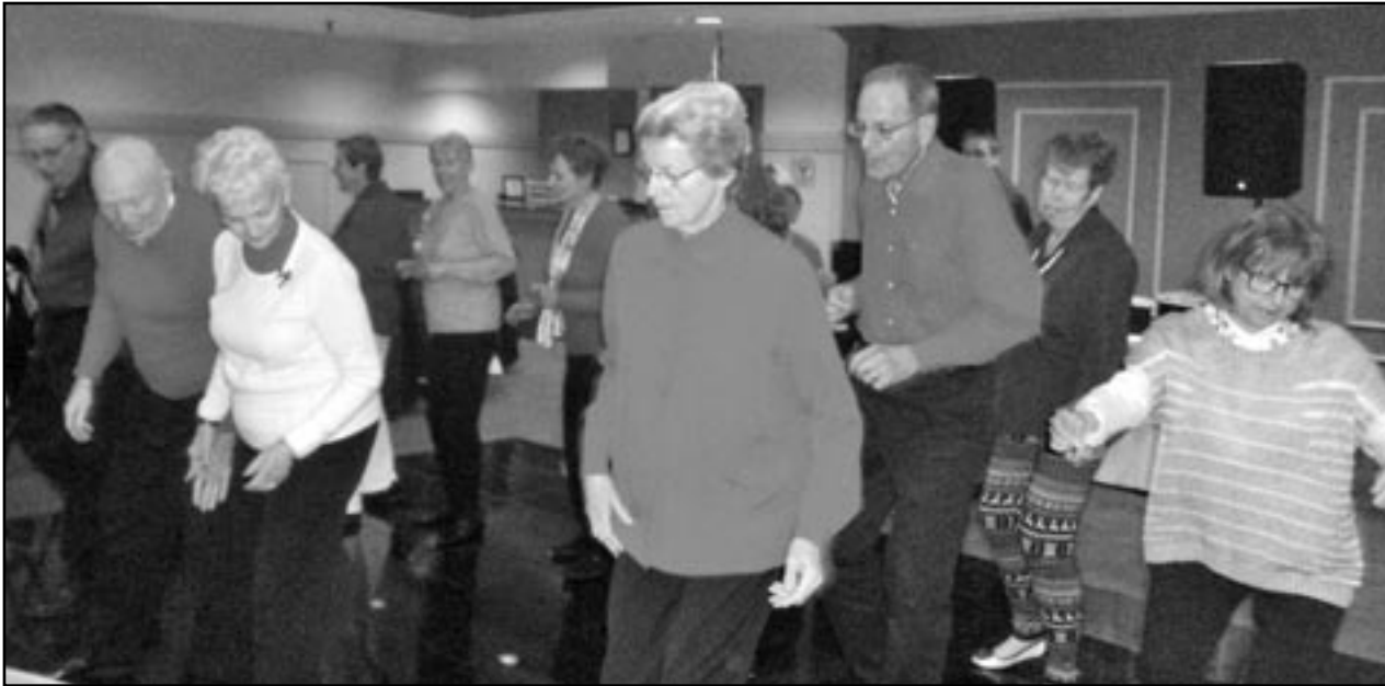
(above) Folks kicking up their heels for the Electric Slide at the Garwood Senior Club Holiday Party held on December 1 at the Westwood.

If you have an interest in preserving Garwood's history, the Garwood Historical Committee will welcome new members to the Committee. You can download the Municipal Boards and Committees Application Form from the garwood.org website, under the "Office of the Mayor" tab, or you can reach out to the Historical Committee at garwoodhistory@garwood.org . You may also come to one of our meetings to speak to us in person.