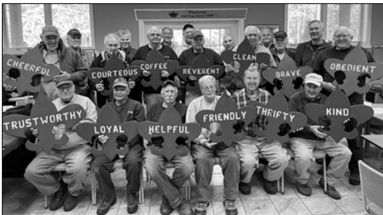
(above) The Flintlocks BSA, Inc. members showing the signs representing the 12 points of the Scout Law. They tease one member for always being seen with a coffee cup in his hand, so they made him a sign reading "coffee". These signs will be posted at the Allamuchy Scout Reservation in Byram, NJ, located near Waterloo Village.

MAIL RESUMES TO AXTRIA, INC. ATTN: HUMAN RESOURCES 300 CONNELL DR., 5TH FLOOR BERKELEY HEIGHTS, NJ 07922