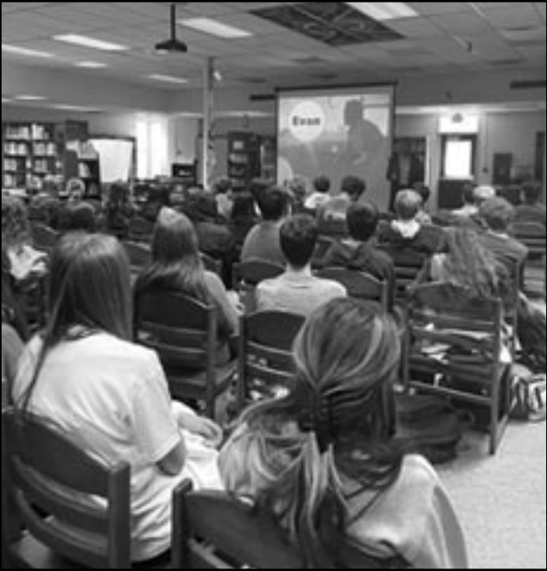
(above) GLHS conducted two days of assemblies with 9th and 11th graders on "Minding Your Mind".

"One of the things I do in my role as a student assistance counselor is act as a resource to students and educate them about the importance of taking care of their mental and emotional