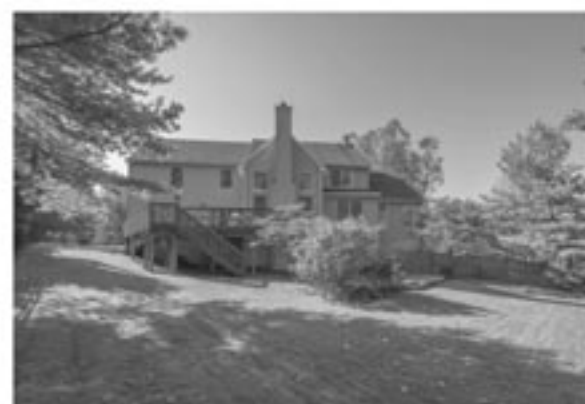
1 Spruce Hollow Road, Green Brook, NJ 5 Bed | 4 Bath | 1 Half Bath | $1,155,000