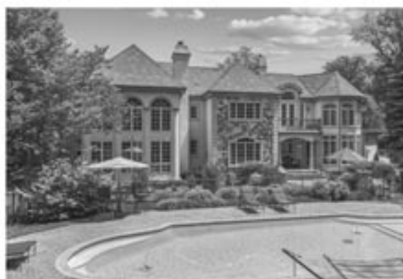
190 Knightsbridge, Watchung, NJ 7 Bed | 6 Bath | 3 Half Bath | $3,250,000