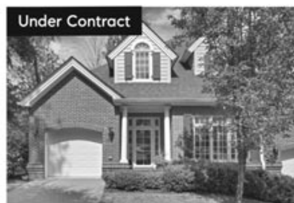
20 Schmidt Circle, Watchung, NJ 3 Bed | 3 Bath | $635,000