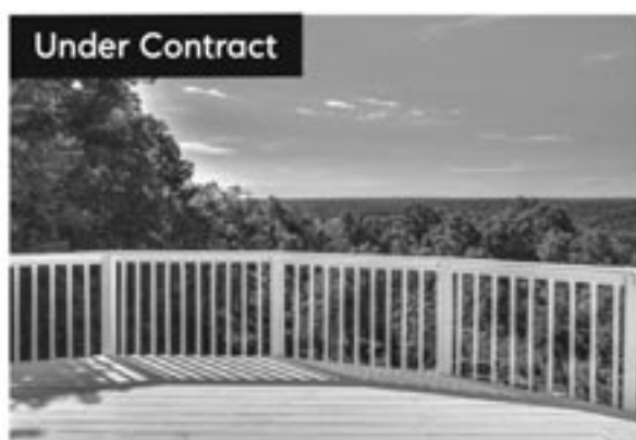
1136 Johnston Drive, Watchung, NJ 4 Bed | 2 Bath | 1 Half Bath | $899,000