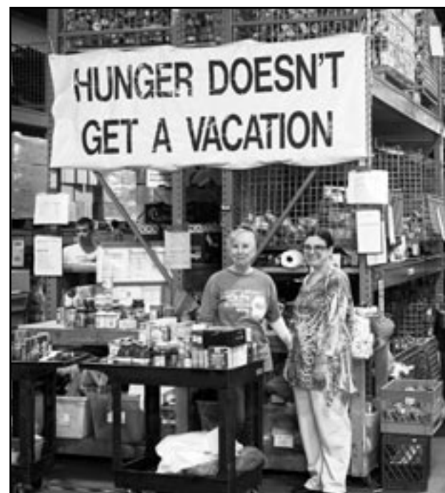
(above) The Somerset County Library System of New Jersey collected over 434 pounds of donation items for The Food Bank Network of Somerset County.

To discover all SCLSNJ has to offer, visit SCLSNJ.org or connect with SCLSNJ on Facebook, Twitter, or YouTube.