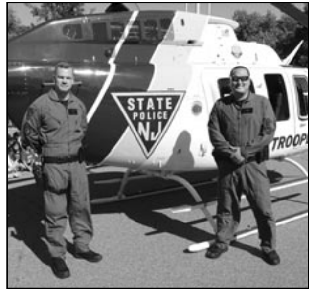
(above) NJ State Police Aviation Pilots

The NJ State Police Aviation Bureau serves as Law Enforcement, Homeland Security, Search and Rescue, and MedEvac response providers. Warren Township Schools would like to thank the Aviation Bureau for sharing this experience with the district and for all they do to keep the residents of NJ safe.