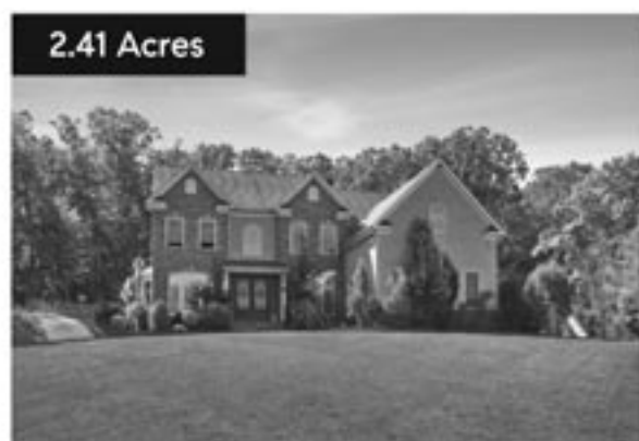
10 Brookside Drive, Warren, NJ 5 Bed | 3 Bath | 1 Half Bath | $1,400,000