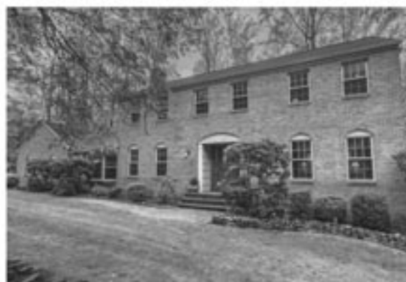
16 Old Forge Road, Warren, NJ 5 Bed | 4 Bath | $899,000