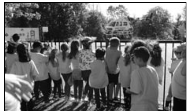
(above) Grade 4 students feel the effect of the wind generated by the helicopter landing.