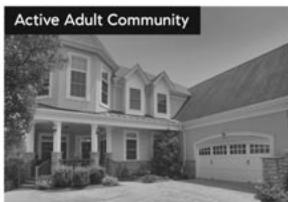
33 Johns Road, Warren, NJ 3 Bed | 4 Bath | 1 Half Bath | $1,125,000