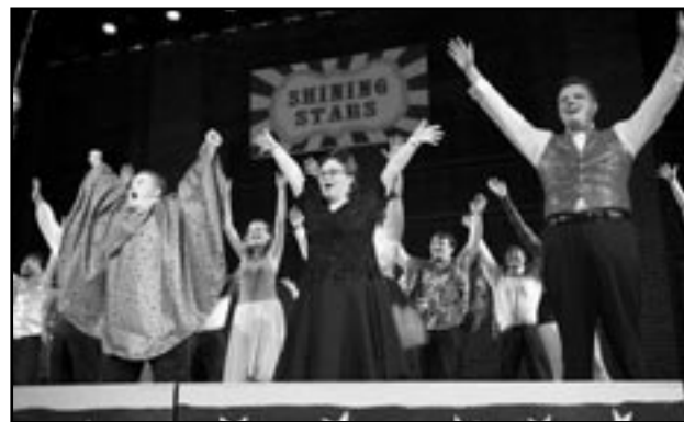
(above) The Shining Stars will take the stage for their 2022 "Christmas Spectacular" on Friday, December 9 at 7:00 p.m.

For more information on Shining Stars Network or to make a donation, please visit shiningstarsnetwork.org .