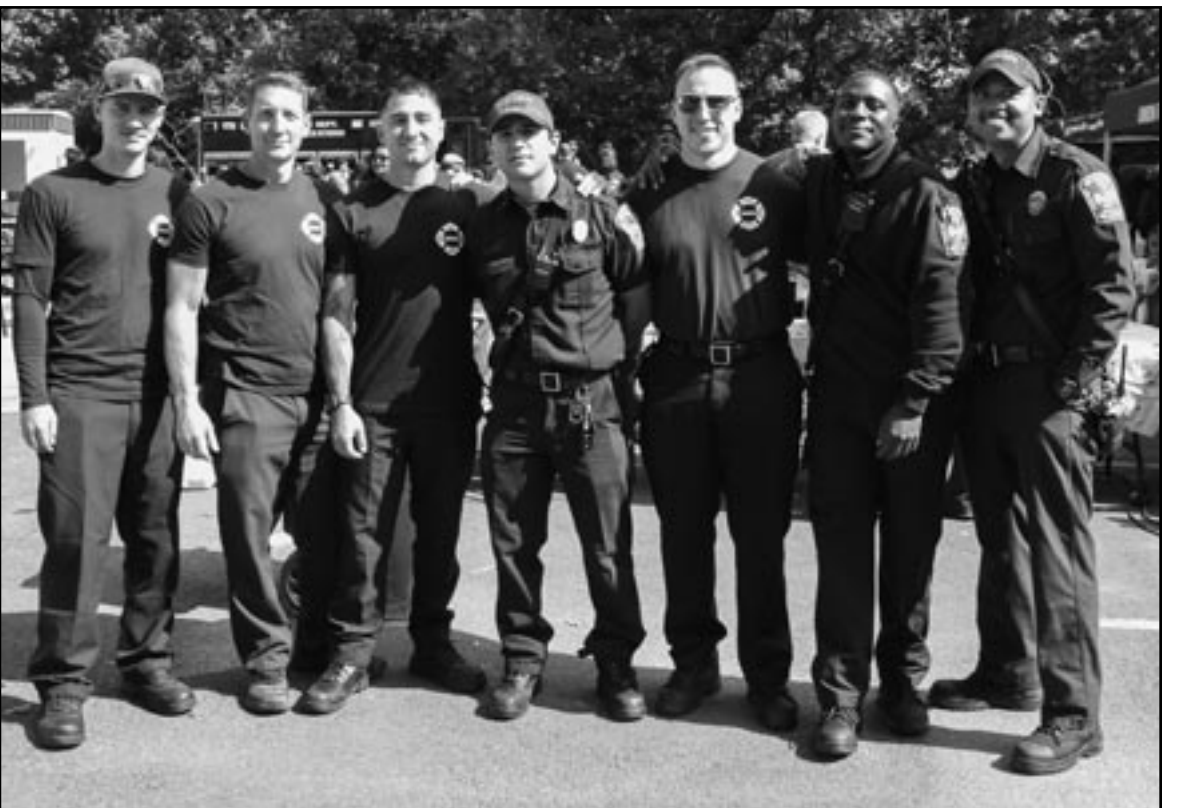
Photos from this and other events can be found online at rennamedia.com and on Spirit of Union page on facebook.com Feel free to "Like," "Tag," and "Share."