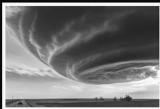
SUPERCCELL STORM CLOUD

near Julesburg, Colorado