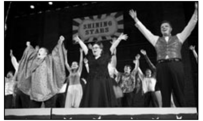
(above) The Shining Stars will take the stage for their 2022 "Christmas Spectacular" on Friday, December 9 at 7:00 p.m.

"Shining Stars Network is not only about