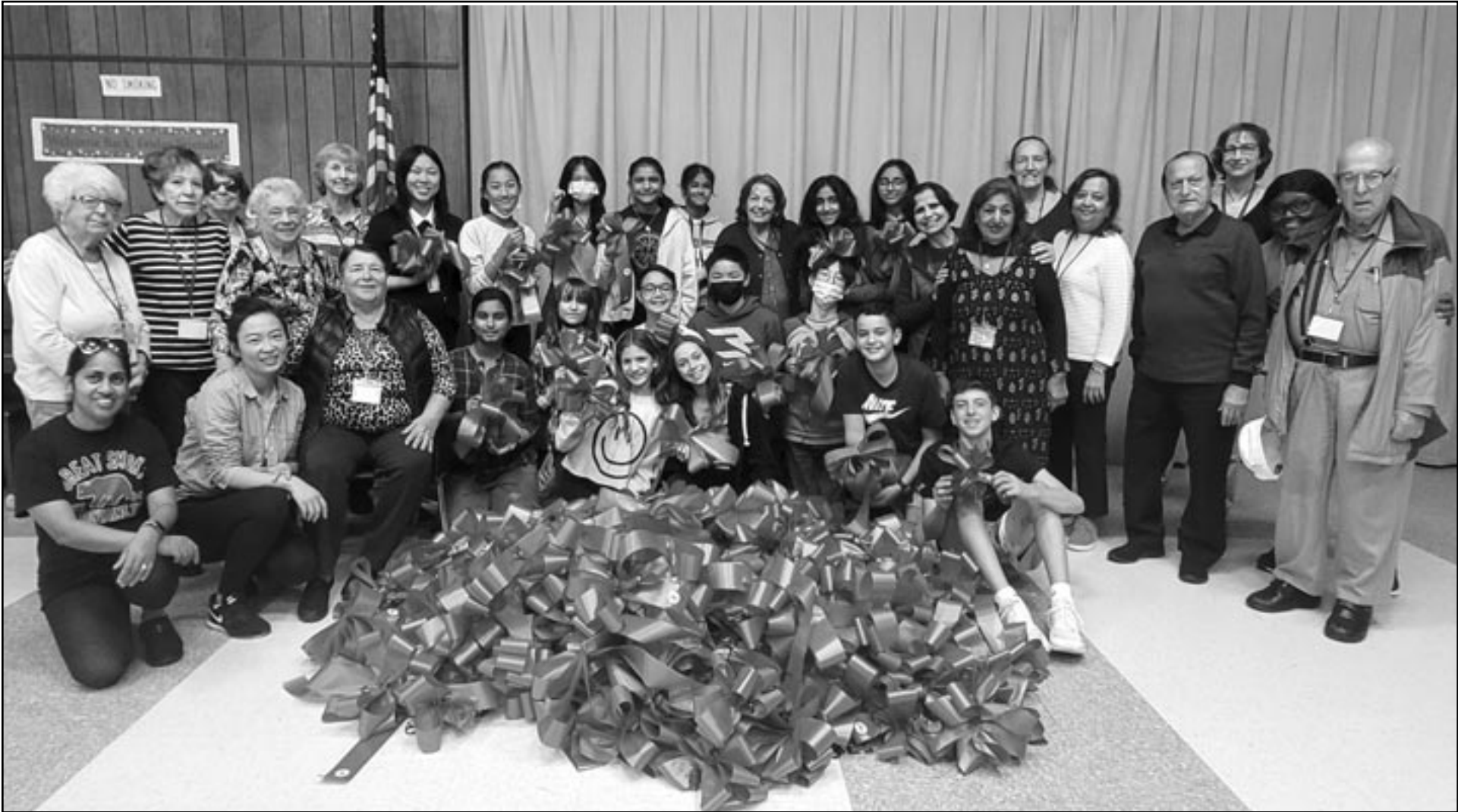
(above) Peer Leaders from Millburn Middle School met with the Friday Friends senior citizen group at the Bauer Center to help make the red ribbons that decorate all the schools across Millburn-Short Hills.

drug-free. The student’s artwork will be displayed in the Millburn Education Center. Did you know that children of parents who talk to their teens regularly about drugs and alcohol are 42% less likely to use drugs and alcohol than those who don’t, yet only a quarter of teens report having these conversations with their parents. Help us spread the message of Red Ribbon Week by having an open dialogue with the young people in your life about the risks and dangers of drugs.