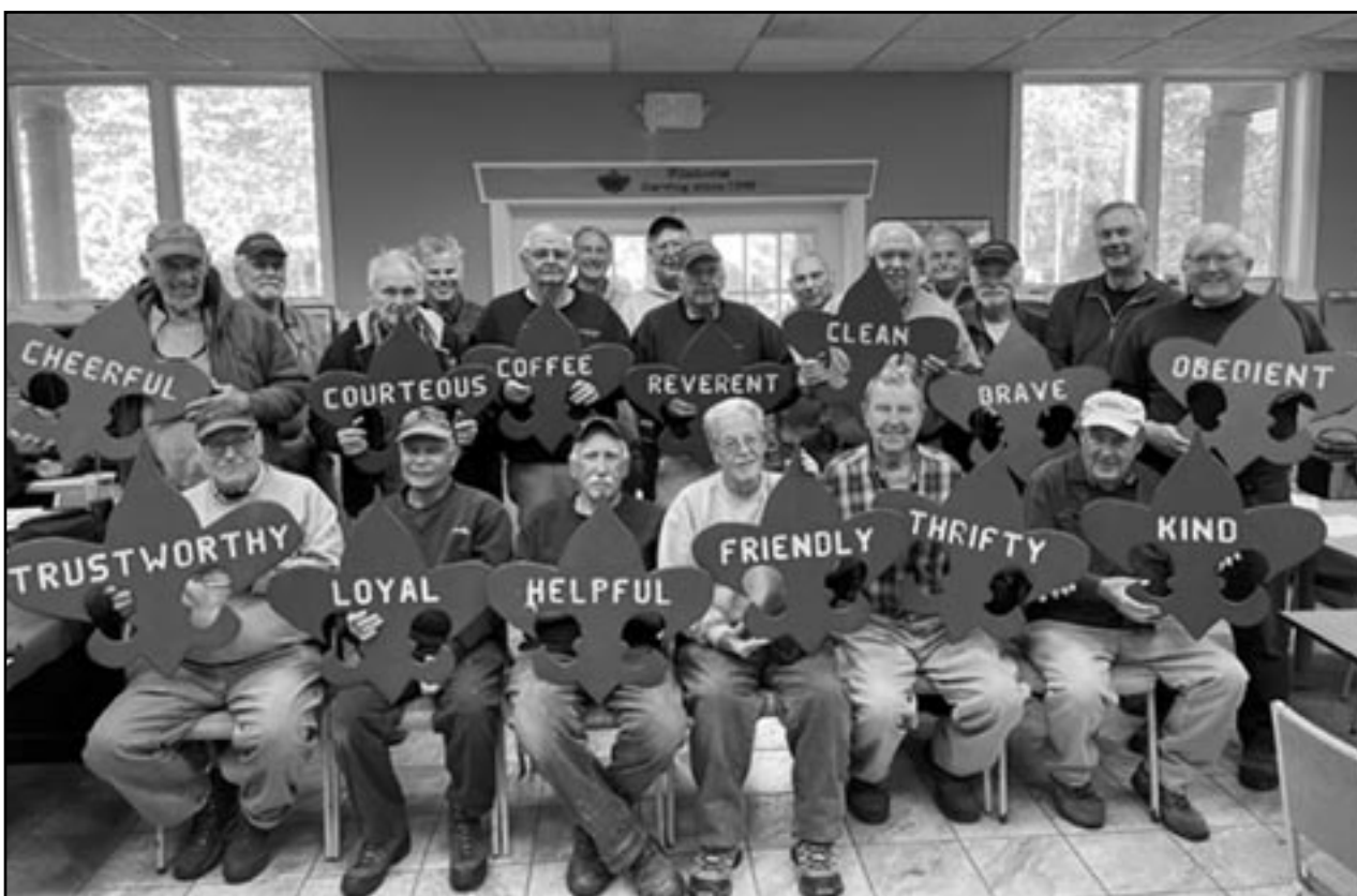
(above) The Flintlocks BSA, Inc. members showing the signs representing the 12 points of the Scout Law. They tease one member for always being seen with a coffee cup in his hand, so they made him a sign reading "coffee". These signs will be posted at the Allamuchy Scout Reservation in Byram, NJ, located near Waterloo Village.