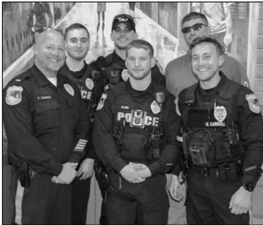
(above) Millburn's first responders, many of whom are veterans