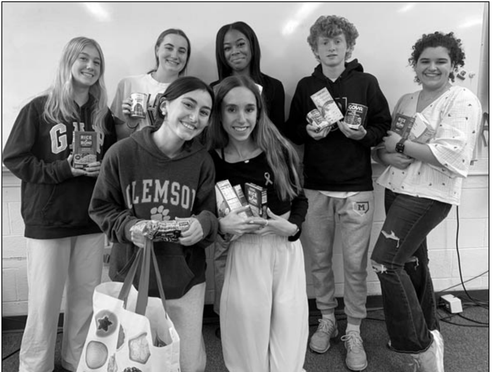
(above) MHS Key Club students are hosting the annual Students Change Hunger Food Drive.