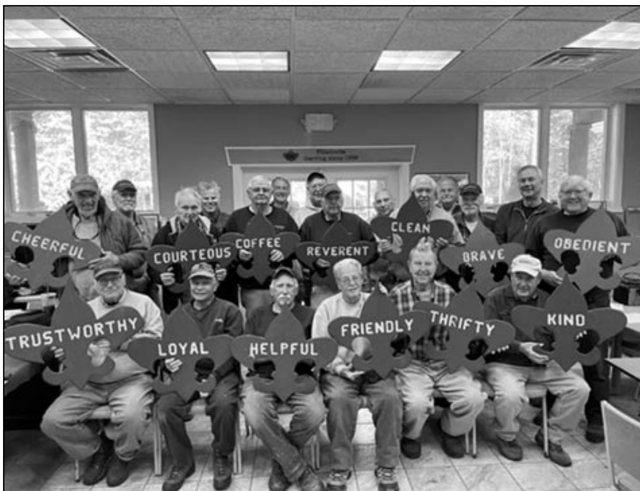
(above) The Flintlocks BSA, Inc. members showing the signs representing the 12 points of the Scout Law. They tease one member for always being seen with a coffee cup in his hand, so they made him a sign reading "coffee". These signs will be posted at the Allamuchy Scout Reservation in Byram, NJ, located near Waterloo Village.