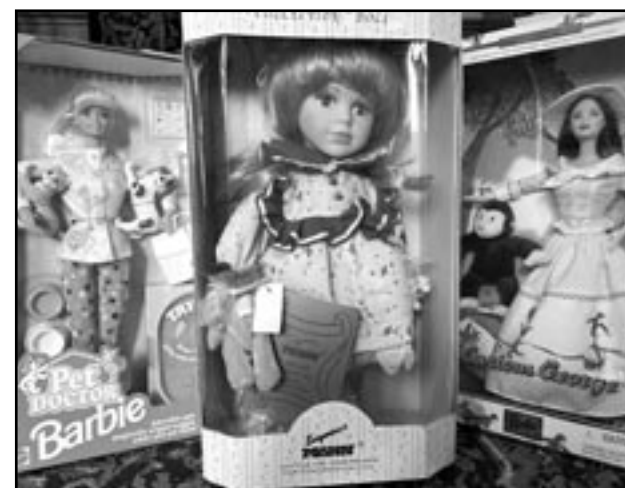
(above) Toys on sale appeal to children of all ages including dolls of all shapes and sizes will line the shelves of the Fanwood-Scotch Plains Thrift Shop during the annual Doll and Toy event starting November 8.

Thrift Shop hours are Tuesday through Friday from 10:00 a.m. to 2:30 p.m., and Saturday from 10:00 a.m. to 1:00 p.m. The shop will be closed Thanksgiving Week from Tuesday, November 22 through Friday, November 25, opening on Saturday, November 26 for "Small Business Saturday." Remember to shop early for the best selections. Have questions? Call the store during Thrift Shop business hours: 908-322-5420.