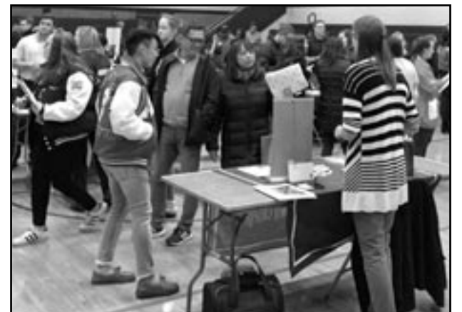
(above) The 69th Annual College and Career Night will be held on Tuesday, November 15, from 7 p.m. to 8:30 p.m. at Scotch Plains-Fanwood High School.

Additional information about the College Club of Fanwood-Scotch Plains can be obtained by sending an email message to Collegeclub.fsp@gmail.com .