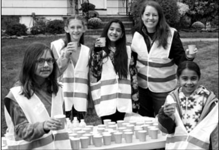
(above) Girl Scouts volunteered at the water station.