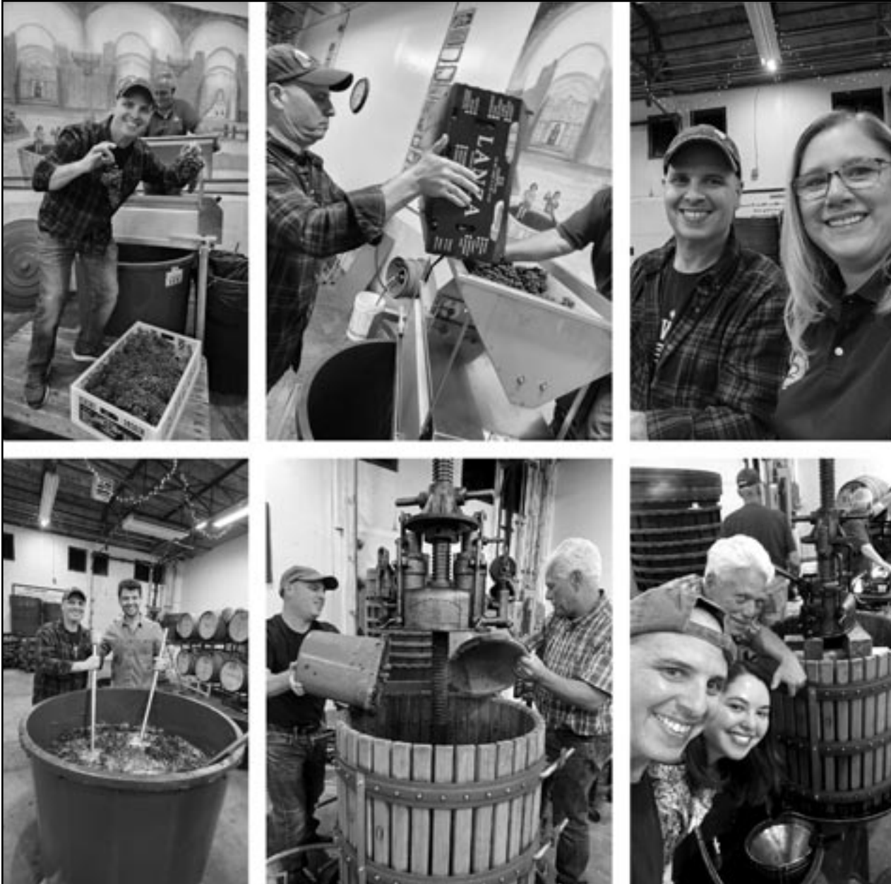
(above) The Scotch Plains-Fanwood Chapter of UNICO continued their annual tradition of wine-making this year.