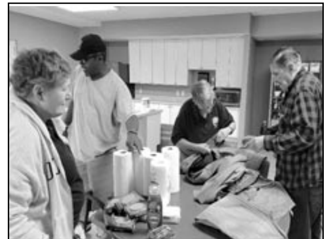
(above) On Sunday, November 5, members of the Auxiliary and the Rescue Squad were onsite at Valley Brook to distributed donations to some of the 112 men and women residing at the independent living community.