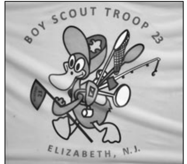
(above) Boy Scout Troop 23 and Cub Scout Pack 23 will be Scouting for Food for the homeless and needy on Saturday, November 19