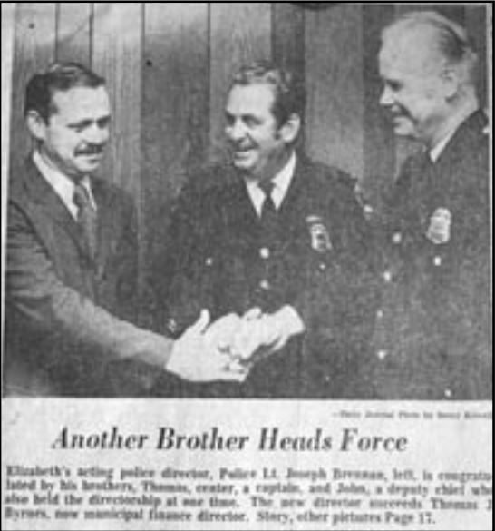
(above) The Daily Journal 9/27/1973