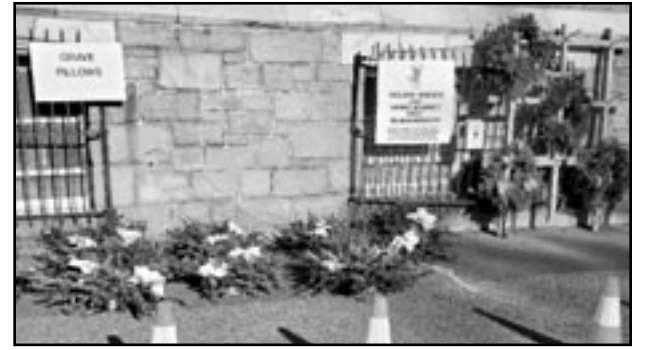
(above) Holiday wreaths and grave blankets will be sold by Boy Scout Troop 23 at St. Genevieve's Church from November 20 to December 11.